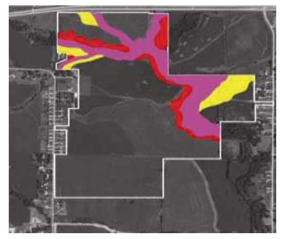
Hydric Soils and Slopes