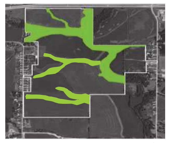
Vegetation & Major Swales