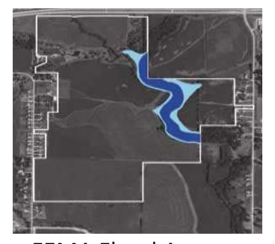
FEMA Flood Areas