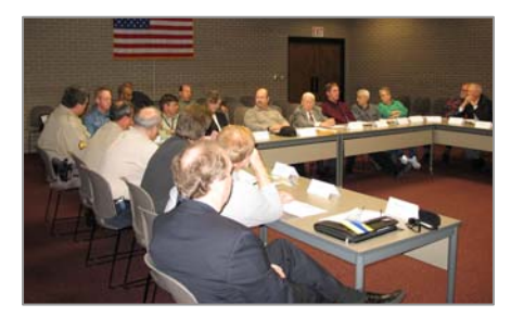
Exhibit 1.3b – Photograph from Community Advisory Committee Meeting

summarized in a Purpose and Need Report by the consultant team. The CAC further discussed the guiding principles as part of the evaluation methodology for the design concepts and responded to the information presented regarding the existing conditions. This meeting engaged the CAC members to focus on initial design concepts and the potential impacts of those designs based on their understanding.