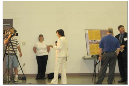
Exhibit 1.3d – Photograph from Public Meeting