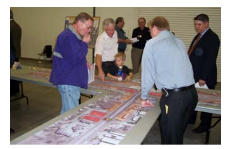
Exhibit 1.3c – Photograph from Public Meeting

Public Meeting #1 (July 20, 2006) – The intent of this meeting was to identify issues and gather input from the public regarding the existing conditions. Open-house style meetings were designed to present information to the various constituent groups and receive feedback and comments regarding that information. This format allowed interaction and individual attention to interested parties regarding the information presented. More than 100 people were in attendance, including residents, business owners, local officials, and several media outlets from within the City of Wichita.