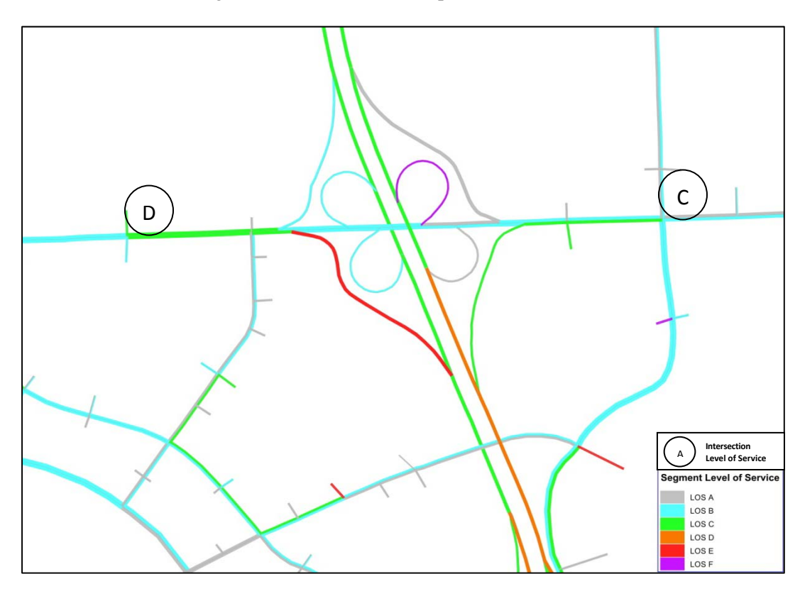
Figure 5.2.1 – Roadway and Intersection Levels of Service for No Build Design Year 2040 Weekday PM Peak Hour Traffic Volumes

The expected Design Year 2040 weekday PM peak hour traffic volumes with the existing I-435 interchange configuration are displayed on Exhibit 5.2.1 . Figure 5.2.1 is a graphical representation of the expected roadway segment level of service for the Design Year 2040 No Build Improvements.