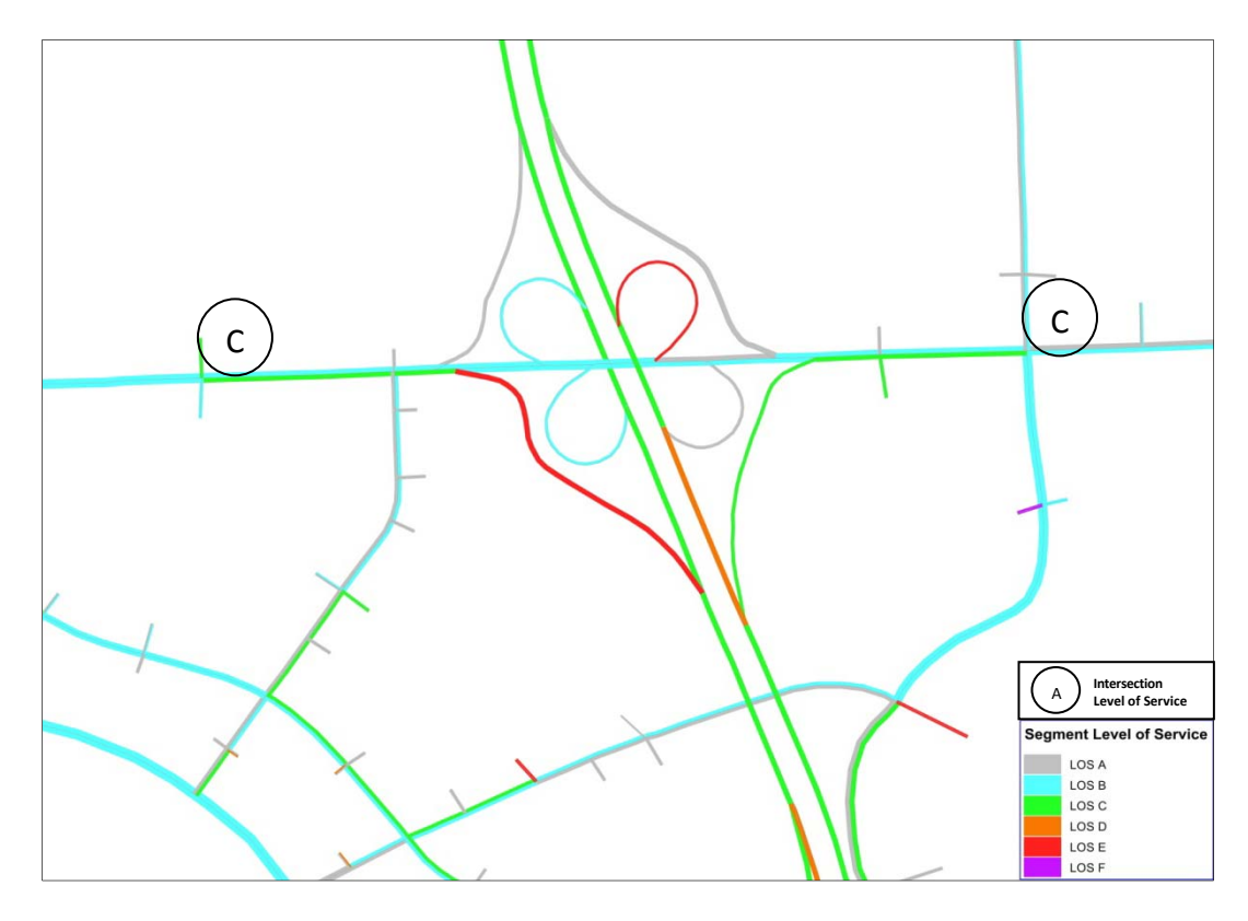
Figure 5.3.1 – Roadway and Intersection Levels of Service for No Build on Parallel Parkway with State Avenue Corridor Improvements Design Year 2040 Weekday PM Peak Hour Traffic Volumes

The signalized intersections of Parallel Parkway with 106<sup>th</sup> and 98<sup>th</sup> Street would both be expected to operate with LOS C during the Design Year 2040 weekday PM peak hour. The northbound and the southbound weaves on I-435 would be expected to operate with LOS C. The change in the southbound weave level of service is due to increased through traffic on I-435 expected to use the improved State Avenue interchange. Additionally the eastbound and westbound weaves on Parallel Parkway would be expected to operate with LOS A and LOS C respectively.