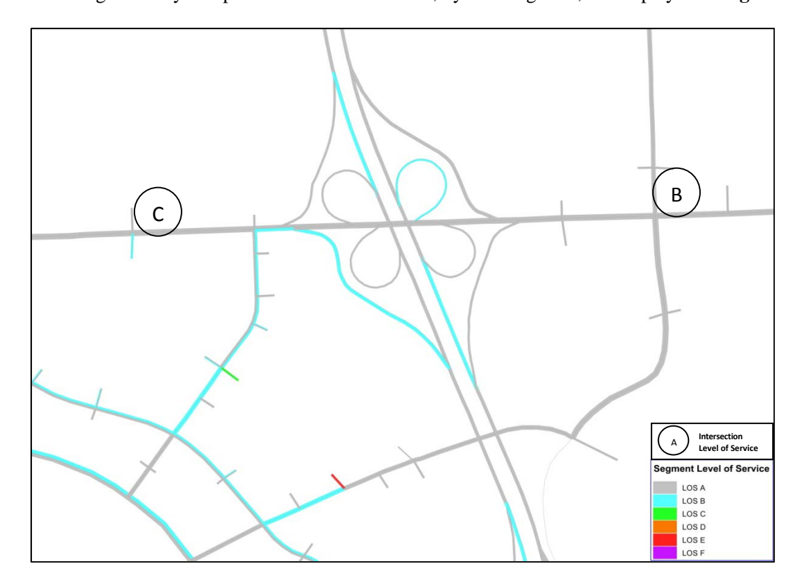
Figure 5.1.1 – Roadway and Intersection Levels of Service for Existing Weekday PM Peak Hour Traffic Volumes

The existing weekday PM peak hour design volumes and Saturday peak hour design volumes at 98<sup>th</sup> Street are shown on Exhibit 5.1.1 and the existing lanes and level of service (LOS) for the weekday PM peak hour are shown on Exhibit 5.1.2 . It should be noted the levels of service for the Parallel Parkway weaves and merges / diverges are estimates only due to the limitations of the Highway Capacity Manual methodology as applied to low speed arterial facilities. The existing weekday PM peak hour level of service, by road segment, are displayed in Figure 5.1.1 .