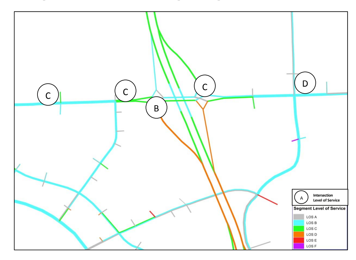
Figure 5.3.4 – Roadway and Intersection Levels of Service for Diverging Diamond Interchange Configuration at Parallel Parkway with State Avenue Corridor Improvements Design Year 2040 Weekday PM Peak Hour Traffic Volumes

The projected traffic volumes for the DDI are shown on Exhibit 5.3.4 . As displayed in Figure 5.3.4 , Parallel Parkway would be expected to operate at acceptable to good levels of service during the Design Year 2040 weekday PM peak period. Traffic operations on the ramps to and from the north would be expected to operate at good levels of service while the ramps to and from the south would be expected to operate at a LOS D.