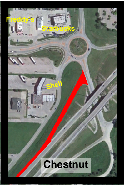
CLOSED 2nd (45 Days) May through June 2024