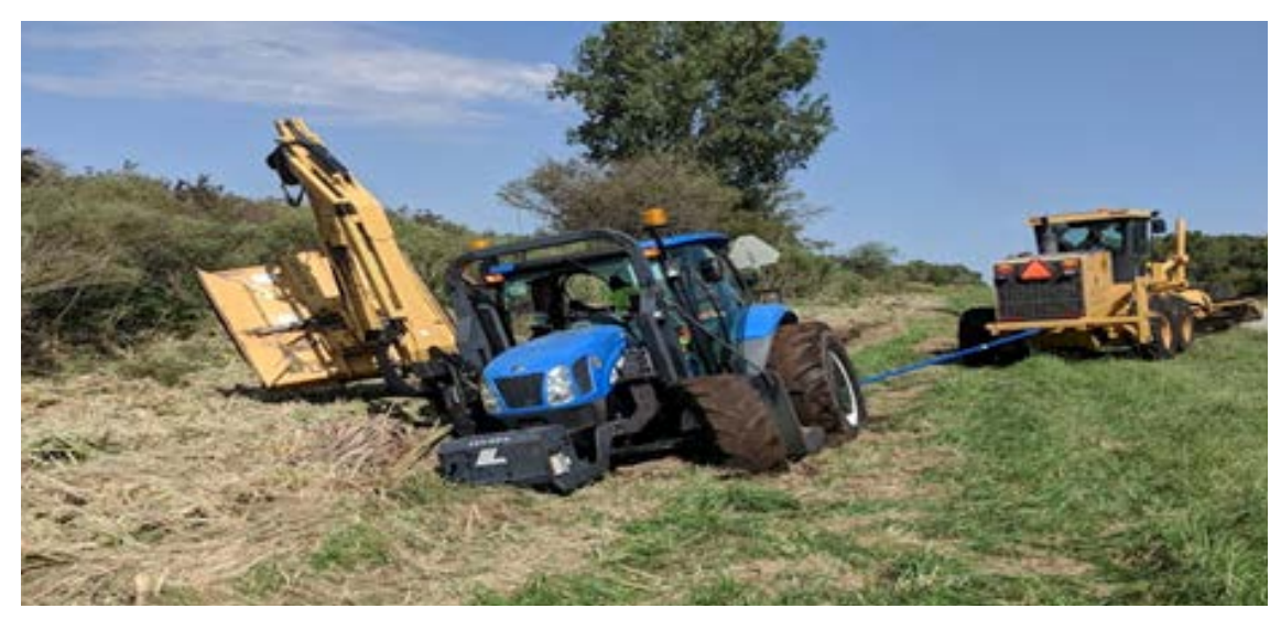
A tractor mower is pulled out with a motor grader and a tow rope. Photo provided