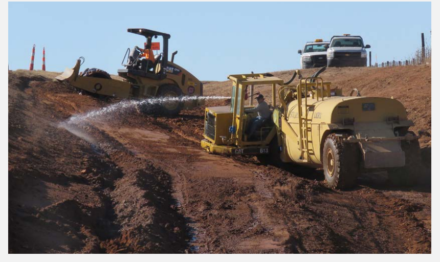
At a cost of $95,000, the project replaced a section of guardrail and increased recovery zone for vehicles traveling in the area.