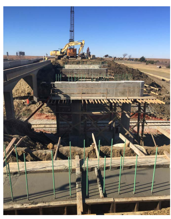
The existing overpass is on the left, south of the new bridge.