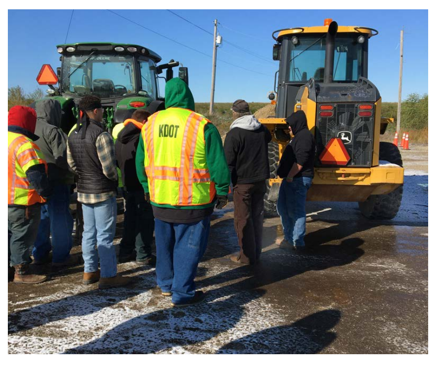
Employees at the Oakland Subarea learn about proper equipment maintenance while participating in snow and ice training.

In addition, new employees attend the winter safety class where the District Safety Specialist discusses