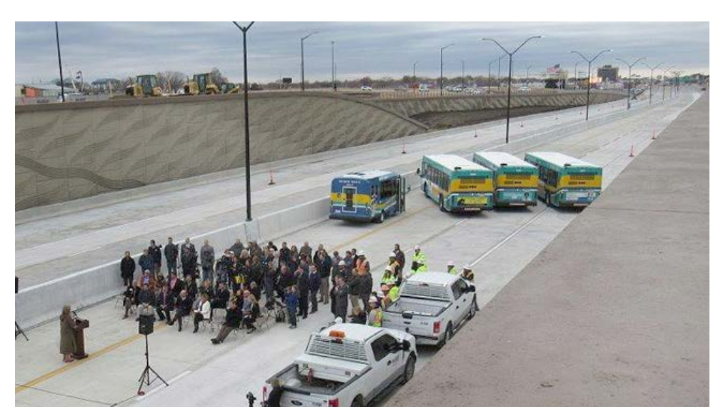
Attendees gather on a stretch of Kellogg freeway to celebrate its opening on Nov. 21 in Wichita.

The Greenwich Road piece started later and finishes in late 2021. It picks up west of Greenwich and continues east over Zelta Street to a new access for the KTA and ends at the K-96/U.S. 54/400 junction.