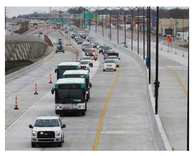
Law enforcement leads officials and other motorists as they drive on the newly-opened stretch of freeway.