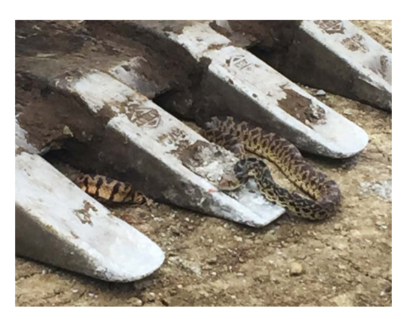
A large bull snake slithered into the bridge project at one point, proving the need to always wear sturdy footwear and watch where you're walking. District Four