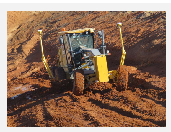
Stoppel Dirt, LLC of Sublette recently completed a grading and dirt work project on U.S. 160 in Clark County.