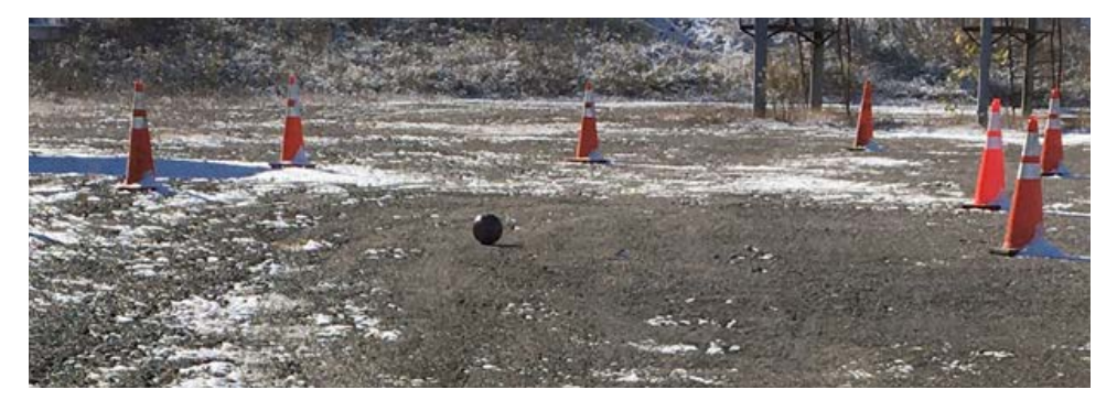
A training method borrowed from District Four involves trainees driving a snow plow on a course and pushing a bowling ball into a goal, which requires depth perception and hand/eye coordination.

safety precautions of extreme weather conditions, what to wear and how to prepare for working long hours. They also go over the truck and attachments with a mechanic and learn about common break downs and preventative measures. The mechanic also goes over proper clean up procedures with the equipment after the snow and ice event is over.