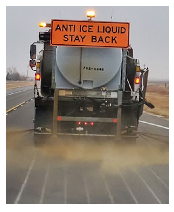
Equipment preparation is a key part of treating highways.

That meant checking dump trucks to make sure lights and strobes were working. District Maintenance Superintendent Chris Collins noted. The preparation, Collins said, also involved hooking up plows and spreaders to make sure they were operating correctly