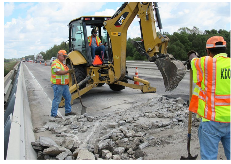
In the photos above and below, KDOT crews patch and place an asphalt overlay on the U.S. 59 bridge over the Neosho River.

The easier drive across the bridge has not gone