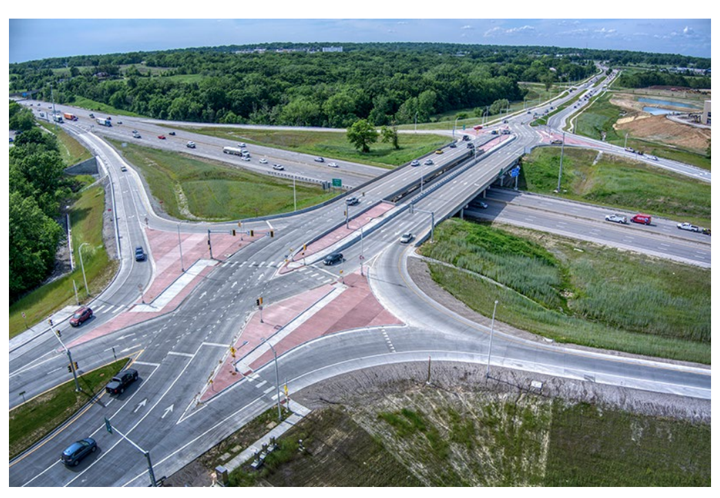
The Turner Diagonal project took top honors in the America's Transportation Award competition for the People's Choice Award.

The ATA People's Choice award winner was determined through online votes from the public. The Turner Diagonal Project was among 12 state finalist projects selected from 80 nominations from 35 states. Finalist states included Arizona, Delaware, Florida, Indiana,