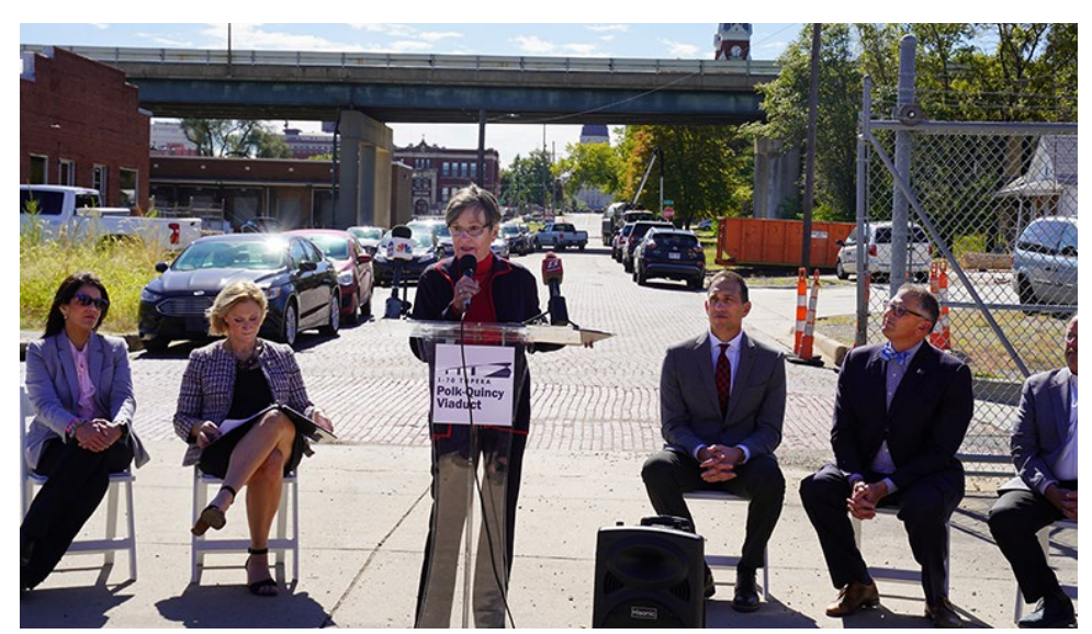
Governor Kelly speaks at the event along with other officials.

Additional project information and future updates can be found at www. polkquincy.org.