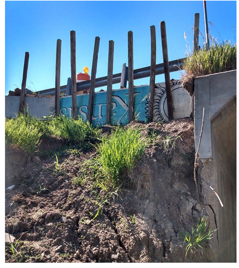
An old "Welcome to Kansas" sign shows resources can come from anywhere as crews used it to temporarily shore up the eroding embankment until the emergency repair job could be completed.

The Stockton subarea crew also discovered a similar issue while mowing along K-18 east of Plainville. The damage was not as severe, however, and KDOT maintenance crews were able to make the necessary repairs.