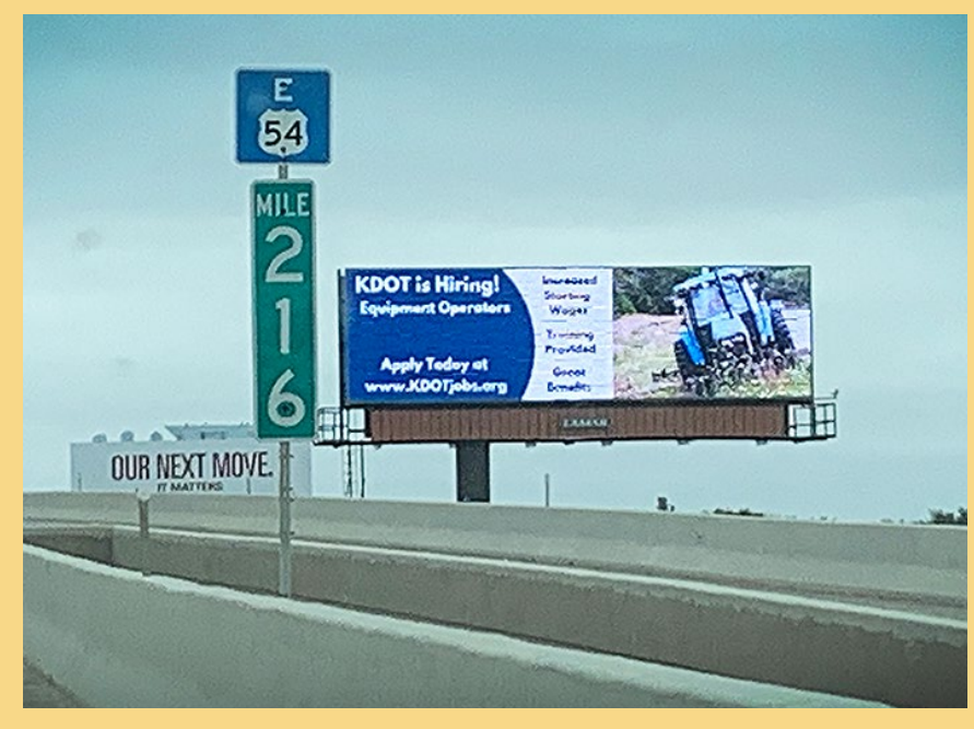
Billboards featuring jobs at KDOT can be seen along several highways in Wichita in hopes to attract new employees to KDOT.

Numerous digital billboards with rotating messages can be seen on some of the busiest roadways in Wichita. Each features basic information regarding the help