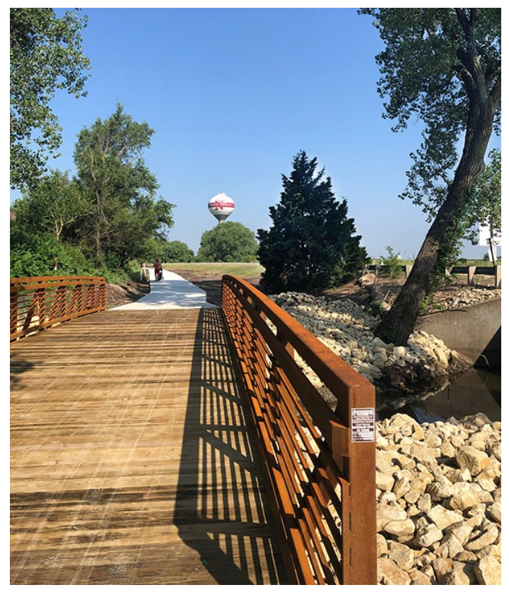
Kidron Loop Trail in North Newton.

partnership with funding coming from federal, state, local and private sources. It is a regional winner in the Operations Excellence (medium) category.