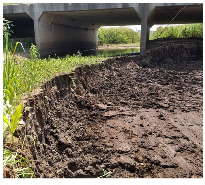
A view of the dirt removal earlier in the job (above) and a view once it was completed (below).

How did all that dirt get there? Over the years, it has drained into four inlets beneath the westbound and eastbound lanes at the bridge. The dirt appears to