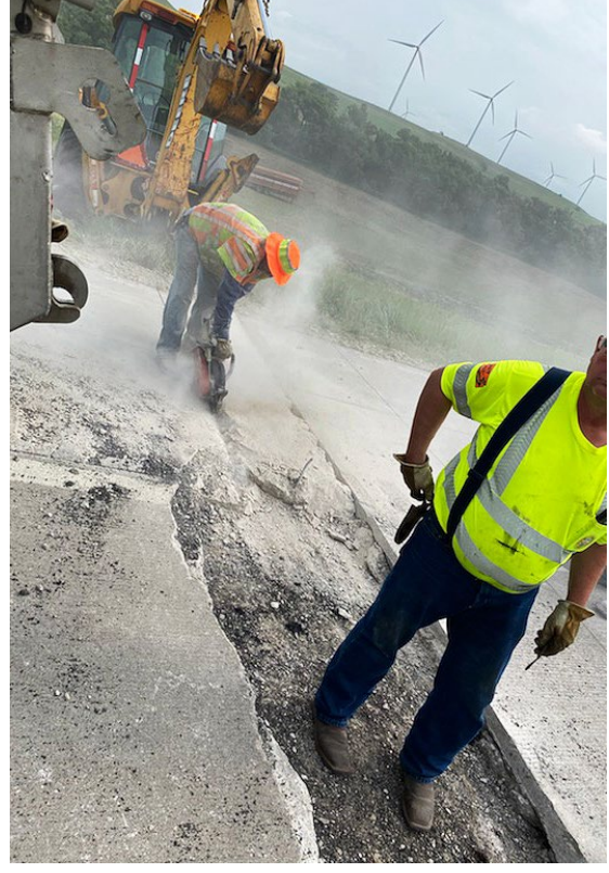
Top left, I-70 pavement in Ellsworth County buckled recently. Above, the Ellsworth Area crew responded and removed the damaged section of roadway. Below, I-70 is repaired and open to traffic.