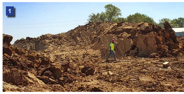
1. Blaster-in-charge checks the area before giving the all clear. 2. Equipment moves material from the post blast excavated area. 3. Workers measure tomorrow's blast grid.

Two short clips of the blast can be viewed here. Stephen Bass' road squad and Brad Rognlie's bridge squad designed the project.