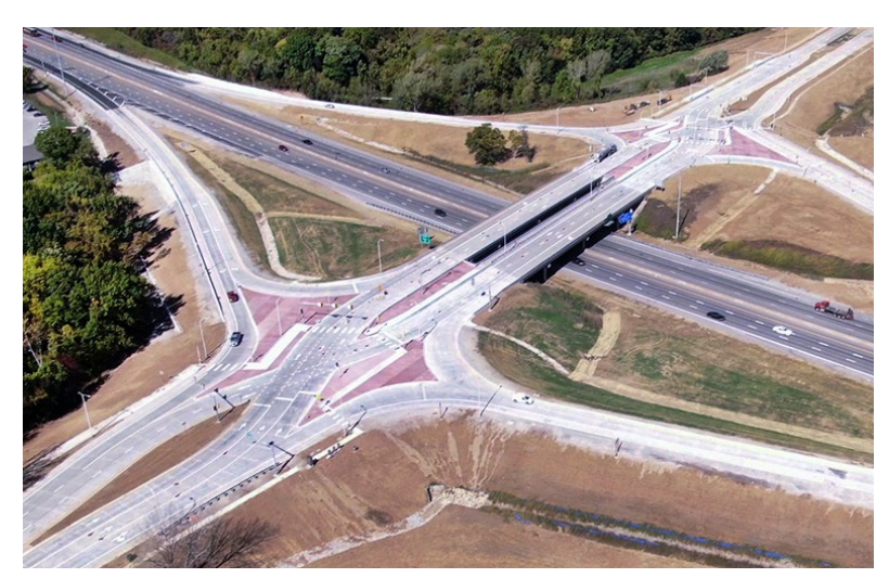
Turner Diagional project in Kansas City.

The Turner Diagonal project in Kansas City reconfigured the interchange, allowing the release of nearly 50 acres of right-of-way and opened 300 acres of land for economic development and job creation. Using alternative delivery methods, the project was completed ahead of schedule, opening in less than a year from ground-breaking. The project involved a public/private