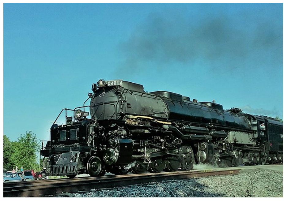
Early on Aug. 12, scattered groups of Labette residents gathered along the railroad tracks to await the appearance of UP's historic Big Boy steam engine. Engine No. 4014 had several stops in Kansas on its way south and will have more on its way north.

operational (the other seven are on display).