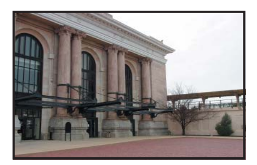
Wichita has not been served by Amtrak since the 1979 discontinuance of the Lone Star due to federal budget cuts.

The cities used in this study are included solely as part of a "What If?" scenario. A city's use in the study is not a commitment by the city or the states for the city to host a station.