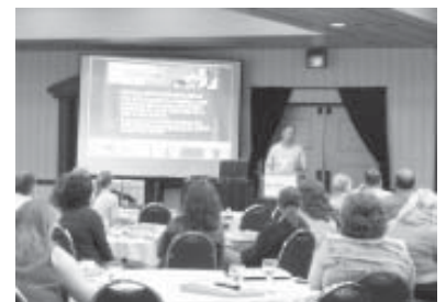
CPS Technician update