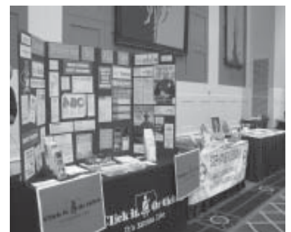
Transportation Safety Conference