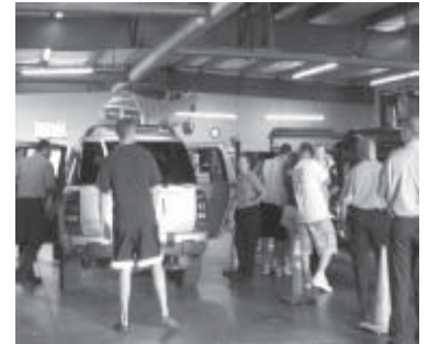
Franklin Coounty Fire, Sheriff and EMS