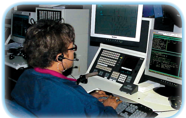
A 911 dispatcher monitors the AVL system