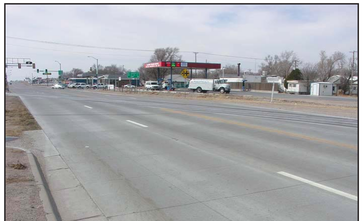
This project on U.S. 160 in Ulysses earned a partnering award from the Kansas Contractors Association and KDOT.