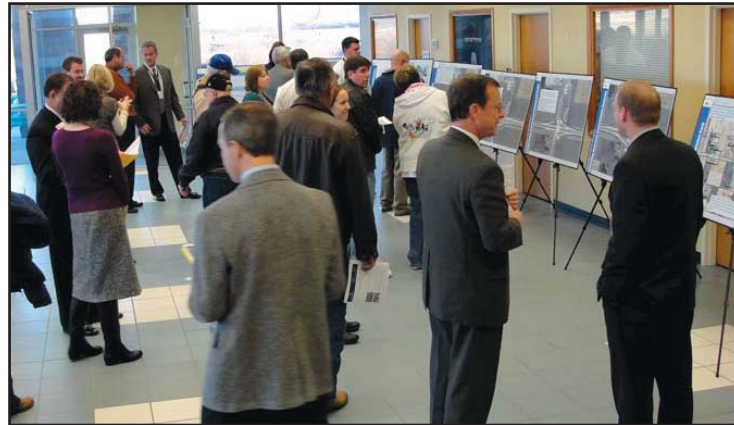
Attendees at the public meeting for the I-135/36th Street interchange project look at displays showing the details of the project.