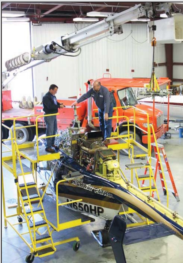
KHP employees inspect the helicopter after KDOT employees help remove the rotor head.