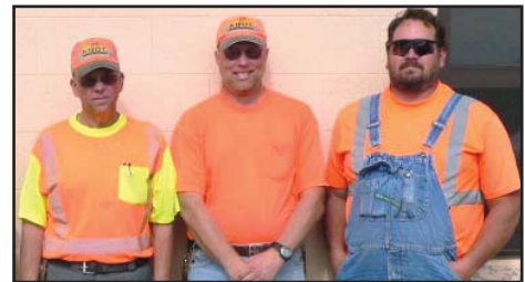
KDOT Executive Staff and employees from Headquarters and each KDOT District wear orange to celebrate work zone safety and show appreciation to all Kansas highway workers as part of National Work Zone Awareness Week.