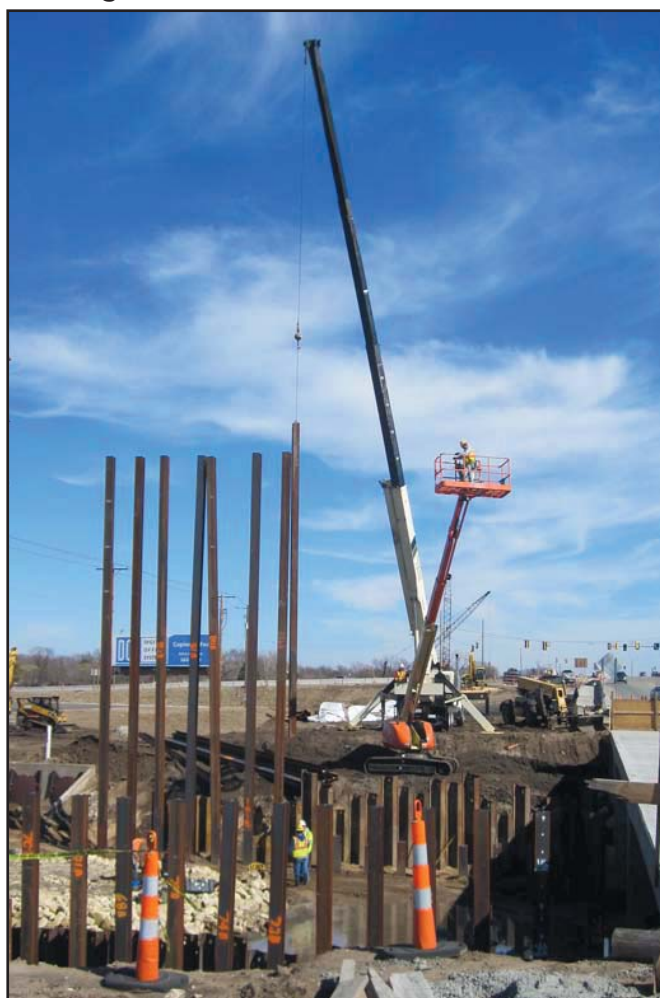
Construction activities have increased as spring weather arrived. Pile driving for a bridge on U.S. 81 over a small creek in south Wichita is part of the I-135/47th Street South interchange project.