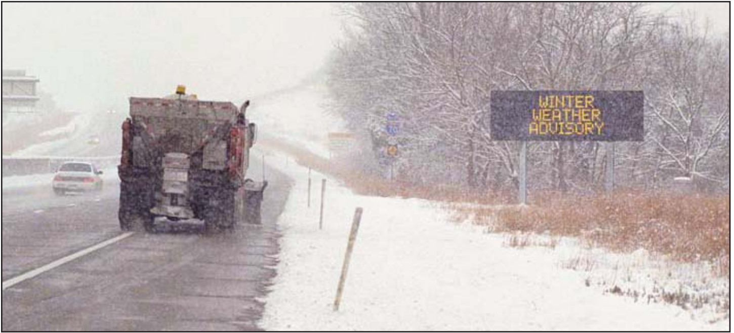
Dynamic Message Signs, such as this one along I-70, provide real-time travel information for motorists that alerts them of road closures, crashes, work zones, inclement weather and other emergency information.