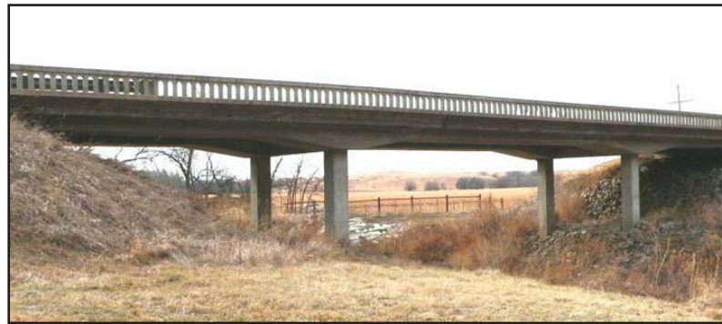
The K-4 bridge in Ellsworth County is currently being repaired.

The other two projects involve an asphalt overlay over the concrete roadway on U.S. 50. The overlay will extend from the Harvey/Marion county line east to Florence west city limit then continues on from just east of the U.S. 77/U.S. 50 junction east to a point 8.8 miles east of the Marion/Chase county line. In total 27.3 miles of U.S. 50 in District Two will be overlaid.