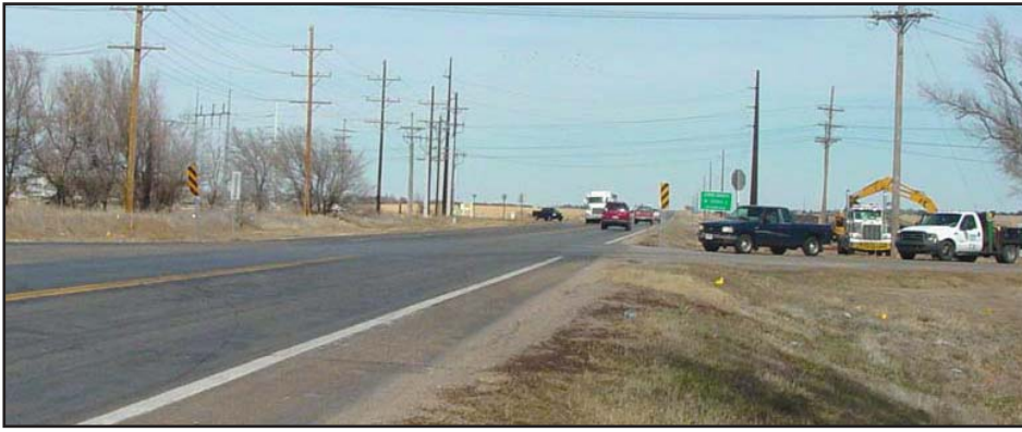
This view to the northeast along K-156 shows the existing alignment of the intersection with Mary Street in the foreground and Jennie Barker Road in the background. The reconfiguration now under construction will replace these two intersections with a single point intersection at a right angle to the highway.