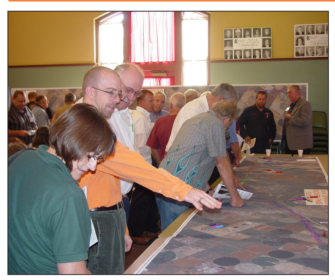
Local citizens and public officials gather around displays of U.S. 54 at a public information open house in Liberal on Oct. 2.

Planning Ahead: More than 100 people attended two events hosted by KDOT on consecutive nights for the purpose of discussing plans to upgrade a portion of U.S. 54 in Seward County to a four-lane expressway. In addition to the meeting in Liberal. KDOT had a meeting at Southwestern Heights High School at the eastern edge of the corridor study area. Expanding U.S. 54 to a four-lane divided highway has long been a priority of regional officials, citizens and highway improvement advocates. Under T-WORKS, KDOT plans to build a 9.5 mile four-lane expressway east of Liberal and develop preliminary engineering plans for a four-lane expressway that would extend to the Seward-Meade county line.