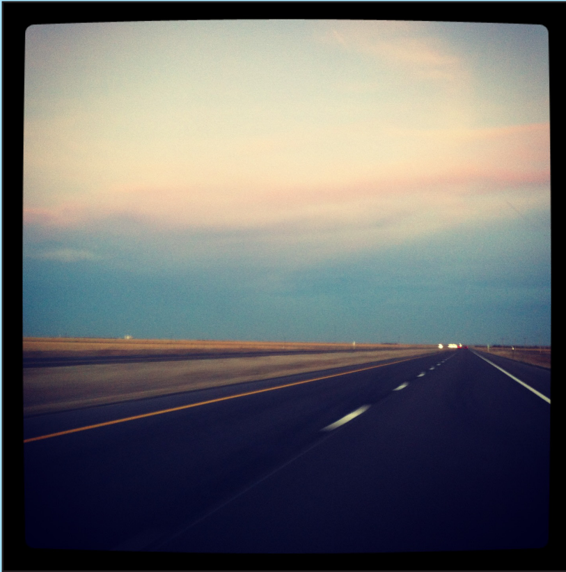
This photo was taken along I-70 near Goodland.

New Technology: Not that long ago travelers had to carry around a bulky camera in order to capture their special moments on film. Now every moment of every day can be captured with the help of a smart phone that can fit in a pocket. Now KDOT is asking that its employees help send in photos of the state in which we all live, work and travel. With smart phone technology users of Kansas highways can capture the roadways with photographs and post to any of these social media sites - Facebook, Twitter, Instagram and flickr. Just use the hashtag #ksroads in addition to labeling where the photograph was taken in an effort to capture every county in the Sunflower state with these photos.