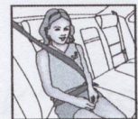
Lap/shoulder seat belt