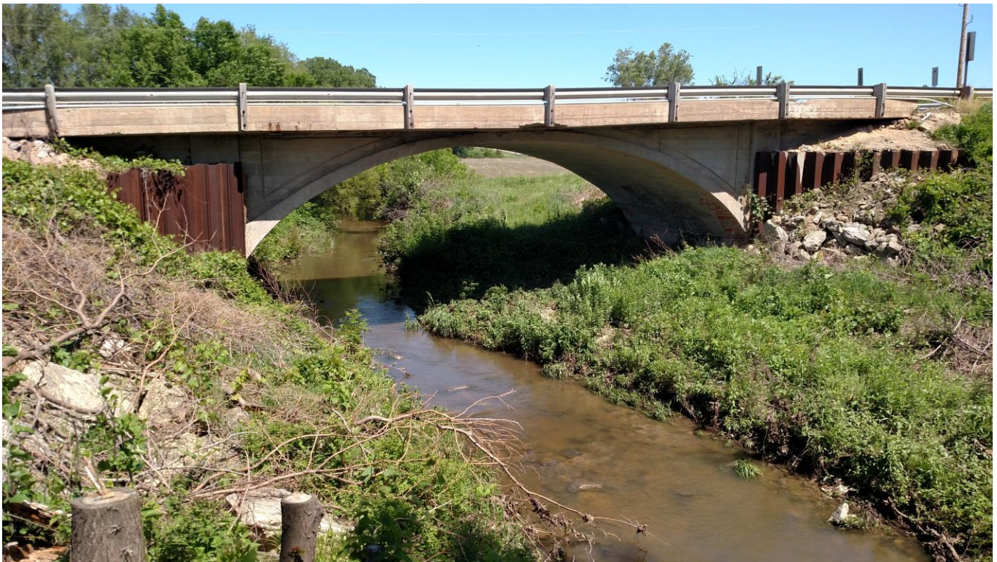
A current view of existing K-63 Bridge over Straight Creek.