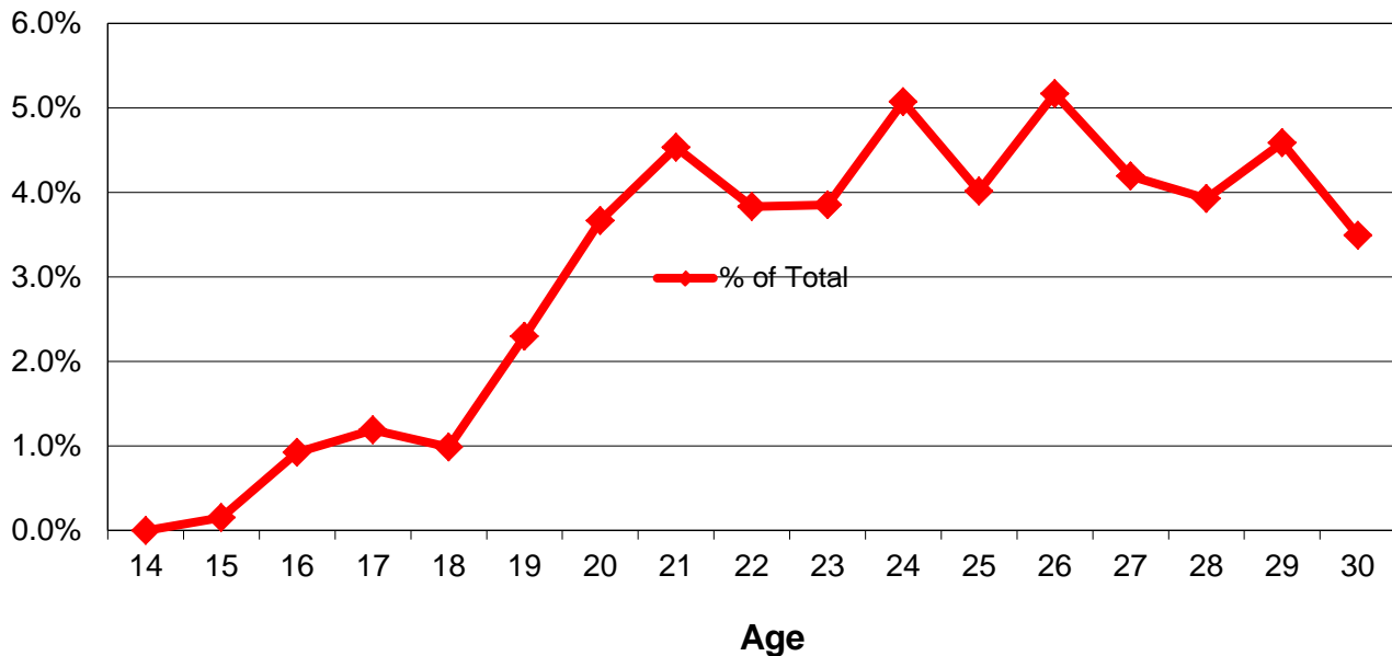
Percentage of Alcohol-Related Accidents to All Accidents by Driver Age