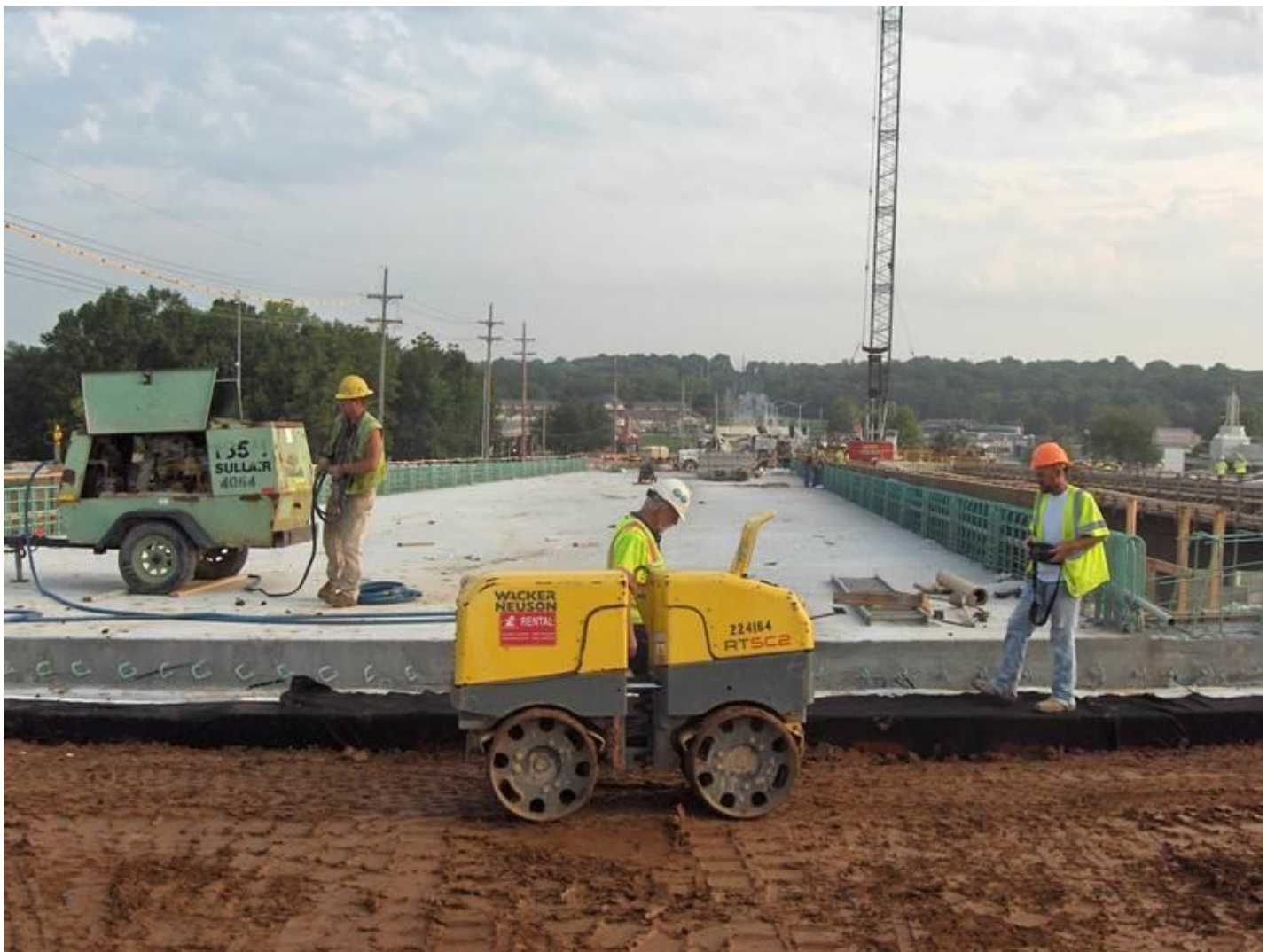
A September 9th look at the new Roe Avenue bridges over I-435. This photo shows the end of the bridge deck awaiting upcoming tie-in pavement work with existing Roe Avenue roadway and interchange ramps.

News Contact: Kimberly Qualls, (785) 640-9340 or kqualls@ksdot.org