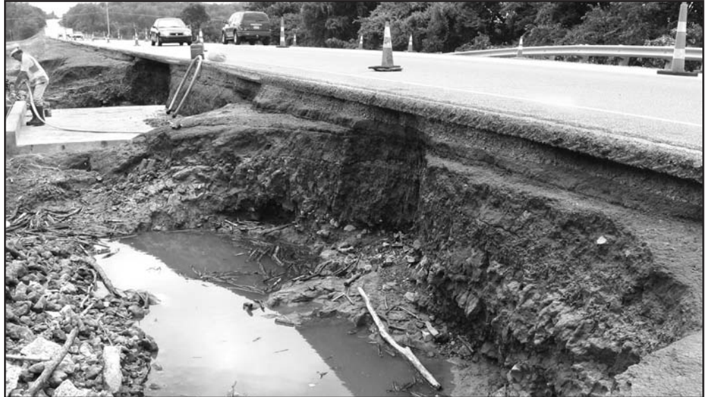
Above and middle right: US-59 north of Garnett was severely damaged by flood waters July 1. Emergency work took place and the roadway is repaired.