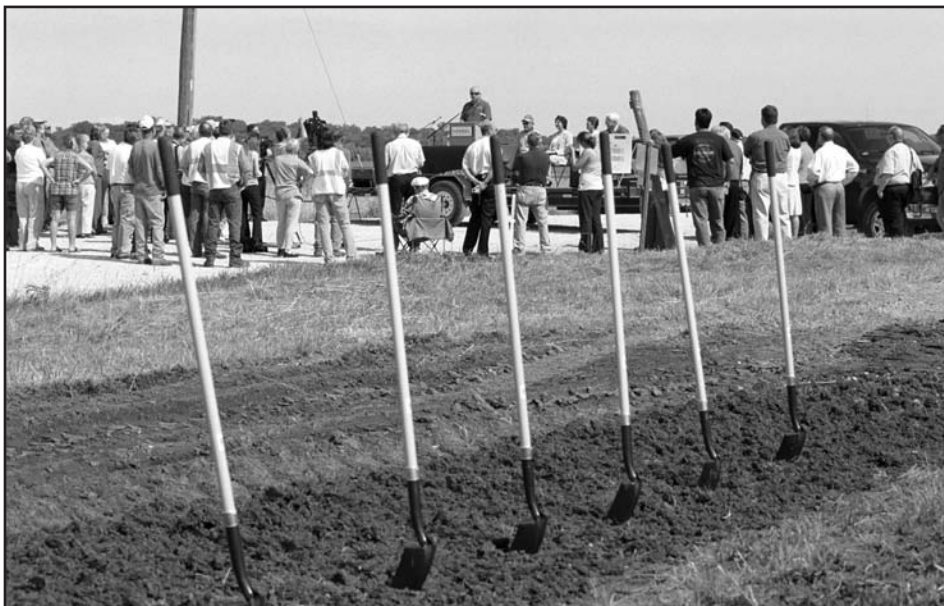
Shovels await dignitaries at the ground-breaking ceremony for the US-59 expansion north of Ottawa.