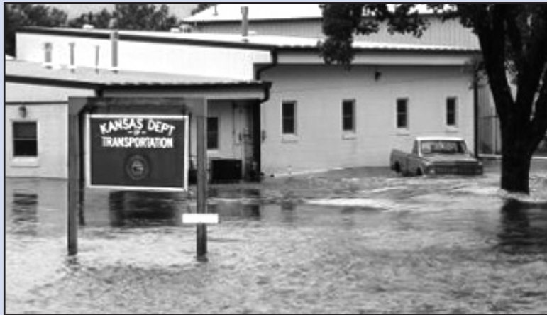
High waters flooded the Erie Subarea Office on July 1.

Each time Kansas has been hit with a weather disaster,