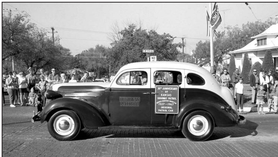
An original 1937 Kansas Highway Patrol (KHP) vehicle is in a parade in 1967, which was the 30th anniversary of the KHP.

The Patrol also has evolved in its communications, technology, and training in 70 years. In 1937, the fleet included four motorcycles and 31 automobiles with silver tops and black bodies. Since then, the fleet has grown to include