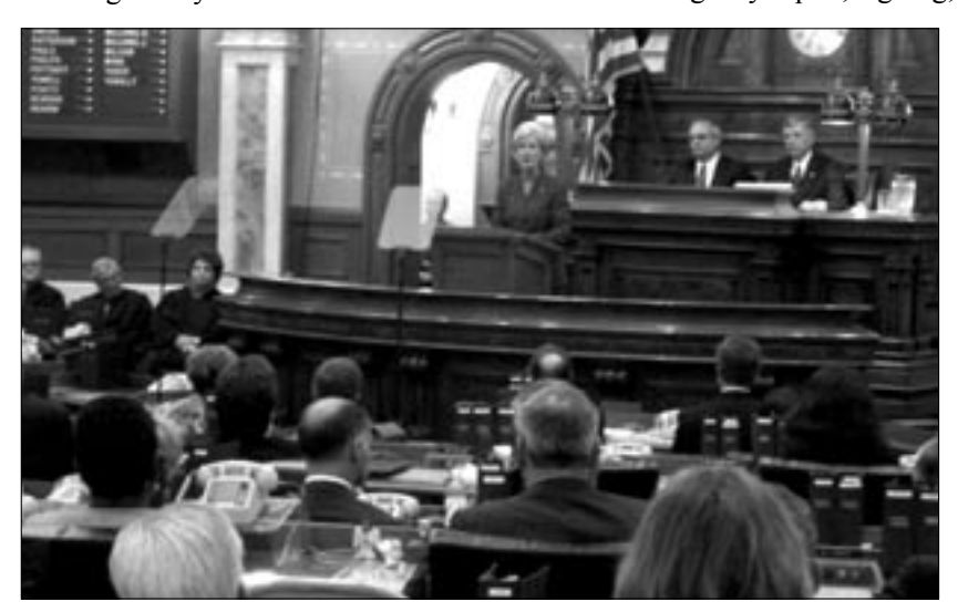
Governor Kathleen Sebelius presents her State of the State address on January 12 at the State Capitol.

sales tax receipts. But in recent tough economic times, other state needs have prompted the Legislature to withhold some, if not all, of the transfer resulting in hundreds of millions of dollars being withheld from the State Highway Fund. The Governor's proposal still withholds any sales tax transfer in fiscal years 2005 and 2006. Then the