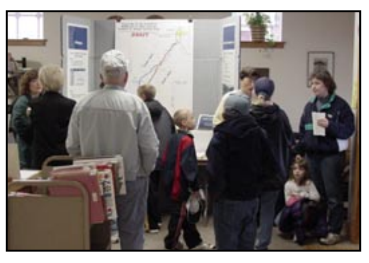
Serveral people stop at the K-61 Drop In Center at the Inman Public Library to find out more about the project.

for the reconstruction of I-135 and 21st Street. Variable message boards can be very effective in communicating limited project information such as scheduled road closings and simple detours, but the mobile radio transmitters can provide a larger amount of information,