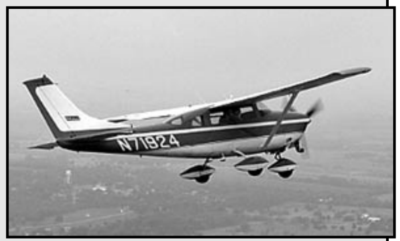
The Kansas Airport Improvement Program is helping to improve safety and enhance community economic development across the

"The projects have been very beneficial to local communities," said Armour. "Improved runways are critical in providing air ambulance service and increasing airport safety. The improvements have also enhanced