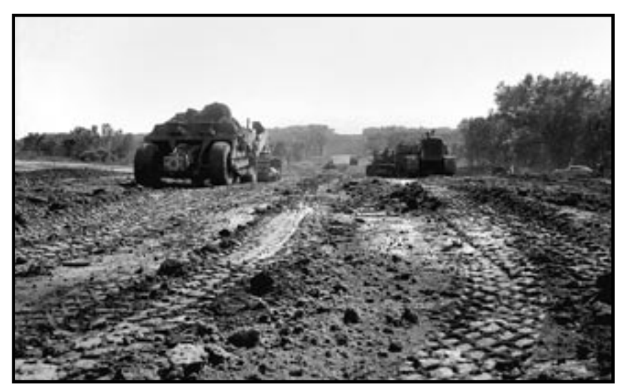
Roadway is cleared for the construction of US-75 north of Holton in October of 1957.