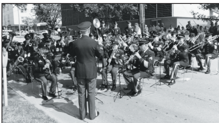
The 35th Infantry Division Band from Olathe (above) and the Topeka High School Marine ROTC Silent Drill Team (right) performed before the ceremony began.