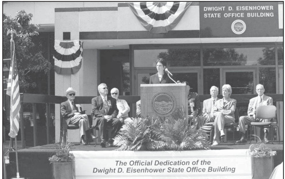
The Official Dedication of the Dwight D. Eisenhower State Office Building

President Eisenhower was also acknowledged for his forward transportation thinking and signing the Federal-Aid Highway Act of 1956