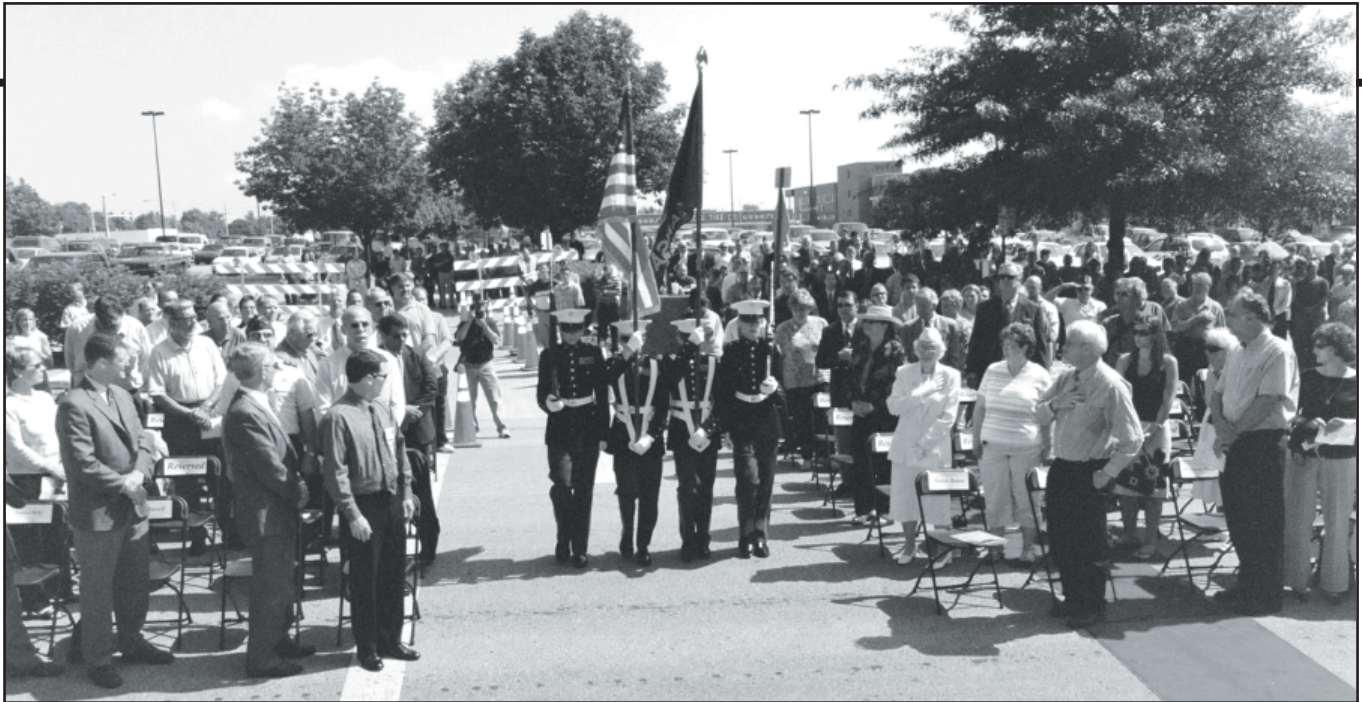
The Topeka High School Marine ROTC presents the nation's colors at the beginning of the Dwight D. Eisenhower State Office Building dedication ceremony on June 6.