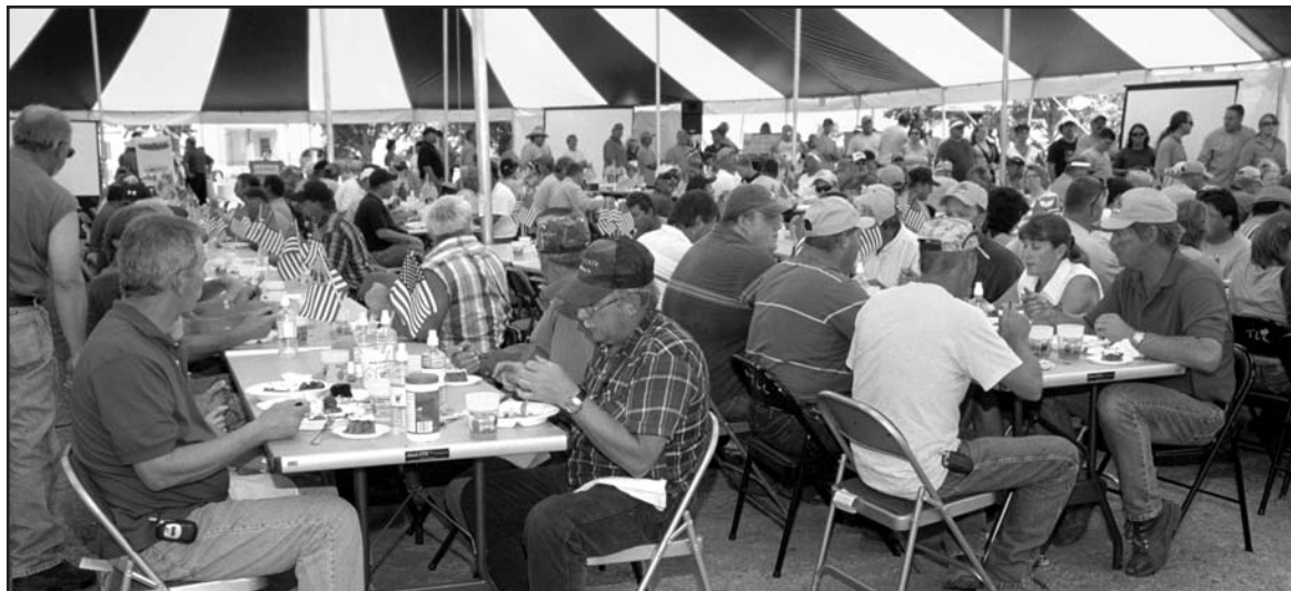
Members of the Greensburg Tornado Response team enjoy a picnic at the tent in the park on July 27. Partners from the Kansas Highway Patrol, the Kansas National Guard and the City of Greensburg also attended.