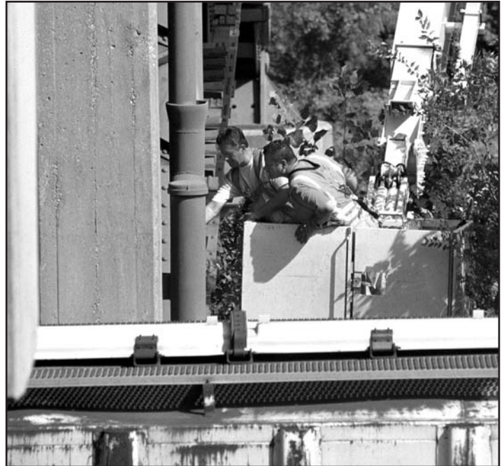
KDOT routinely inspects all bridges on the State Highway System such as this one on US-169.

Prior to the Minneapolis collapse, hands-on inspections had already been scheduled for the other three deck truss bridges. The bridges, comprising parts of the I-70 intercity viaduct in Kansas City, Kansas, started receiving their bi-annual inspections on Aug. 13 and are expected to take about six weeks.