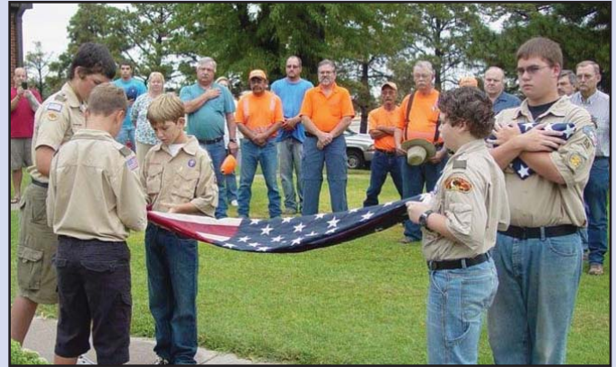
District Six event

On Sept. 11, there will be a very special reminder of your service when we fly a flag over the Eisenhower State Office Building in Topeka that was flown by the Kansas National Guard during a deployment to Iraq. The flag, which was flown by the 1st Battalion, 161st Field Artillery, has been flown over all of our