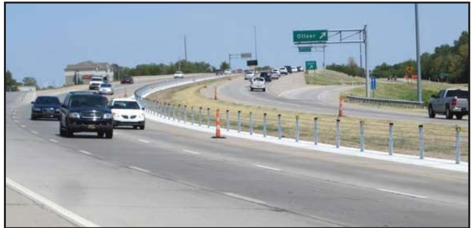
The new cable median barriers can be seen along K-96 in northeast Wichita.

in lower than estimated. About $30 million has been allocated for the passing lane projects. Surveys began in August and construction of the first projects will occur in 2015.