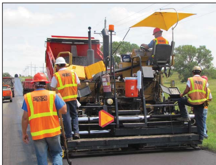
Crews with APAC, Kansas Inc. try to stay cool while working on a maintenance job to overlay spur route K-204 in Smith Center.