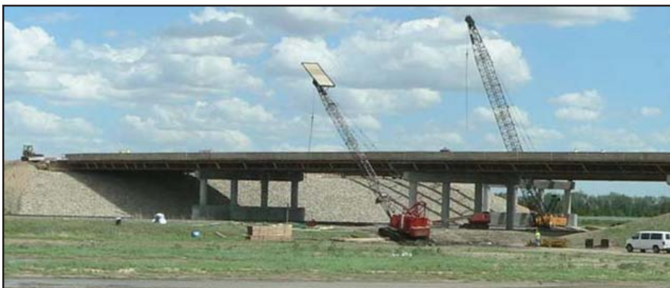
These K-61 bridges are nearing completion.

Currently, fencing is being replaced and concrete drainage structures are be-