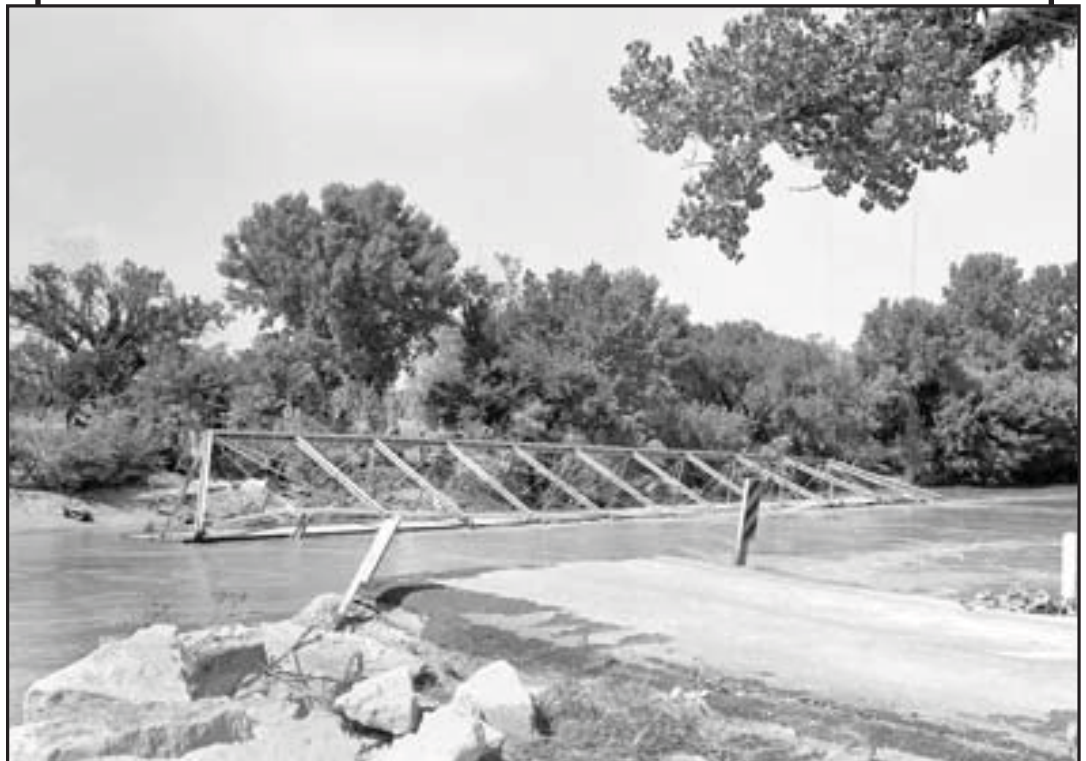
The U.S. 77 bridge over the Smoky Hill River south of Junction City succumbs to high water during the 1951 flood.