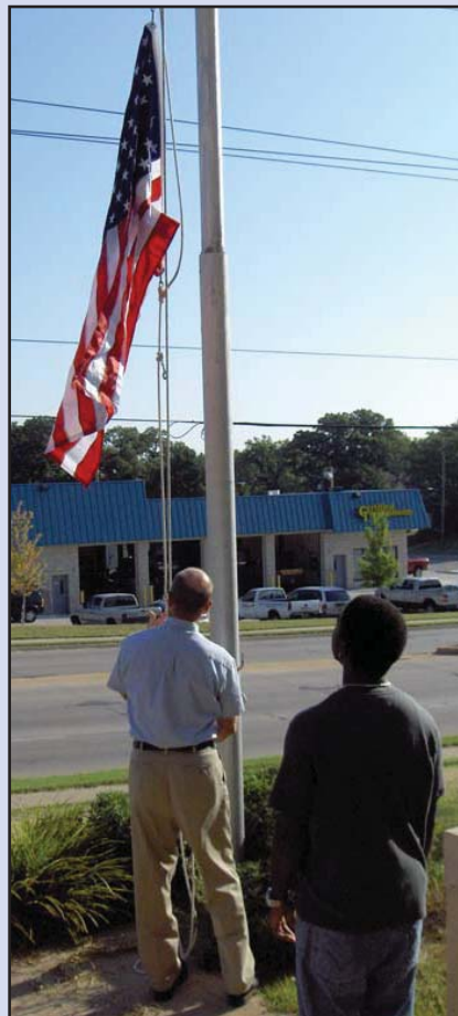
District One event

As the nation reflects on 9/11 this month, please think about our co-workers and partners who do so much to keep us safe here and abroad. I know that's what I'll do every time I pass the flag that will be on display in our lobby.