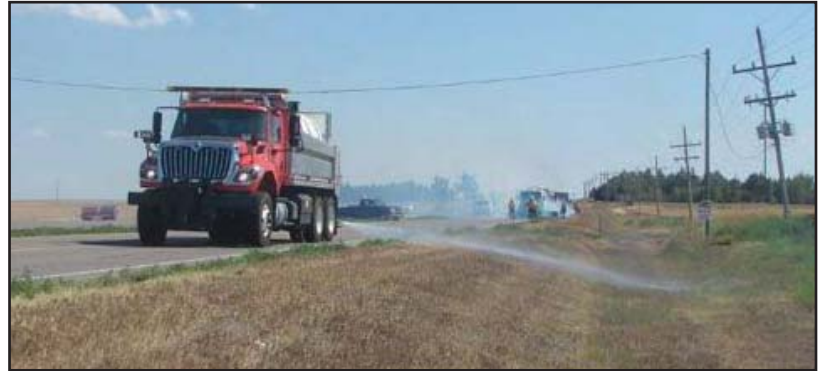
To reduce the risk of fire, a KDOT crew sprays water ahead of work taking place on U.S. 283 in Ford County.