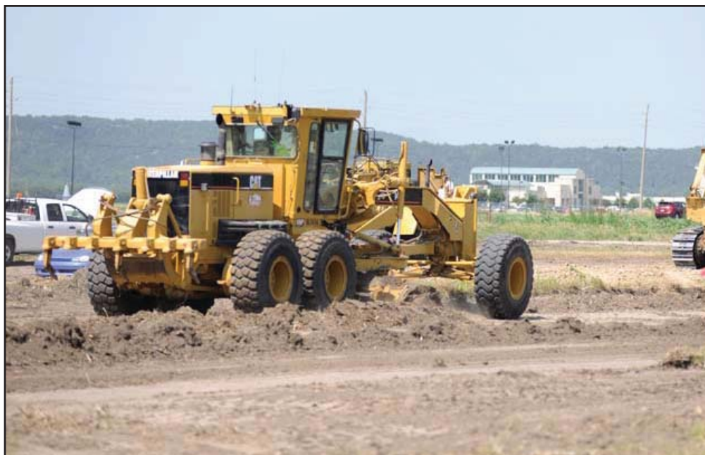
Grading work takes place along part of the K-18 project in Riley County.

Anyone can read the information on KTOC, but to make comments and share information, just log in and become a member. -K.S.