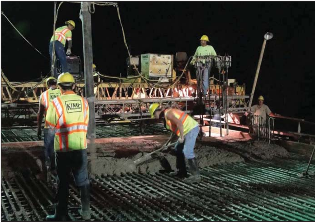
At left, King Construction does a bridge pour at night for a new K-14/K-96 bridge south of Lyons.