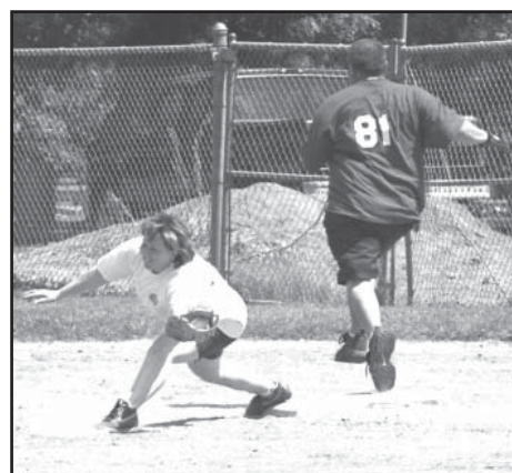
The third time was a charm as the annual KDOT softball tournament took place on August 14 at Gage Park in Topeka after being rained out two times earlier in the summer. Eight teams participated in the tournament with a picnic and games for kids as well.