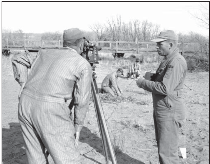
A survey crew pays special attention to detail as they handle their work duties during a project in the late 1950s.