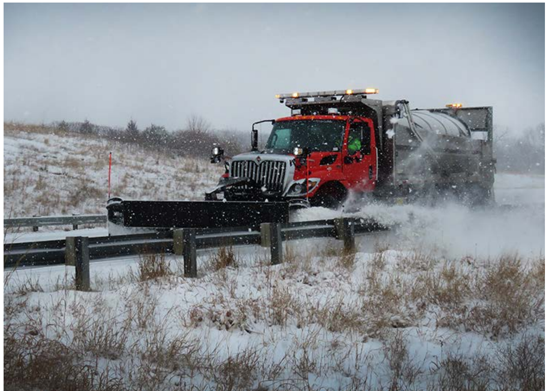
KDOT snowplow drivers take immediate action any time inclement weather hits, whether it's a regional or statewide storm. File photo

"Our maintenance crews always do their best to serve the public as they work 12-hour shifts in their efforts to clear the highways," said Secretary Lorenz. "But motorists can help by checking on road conditions and