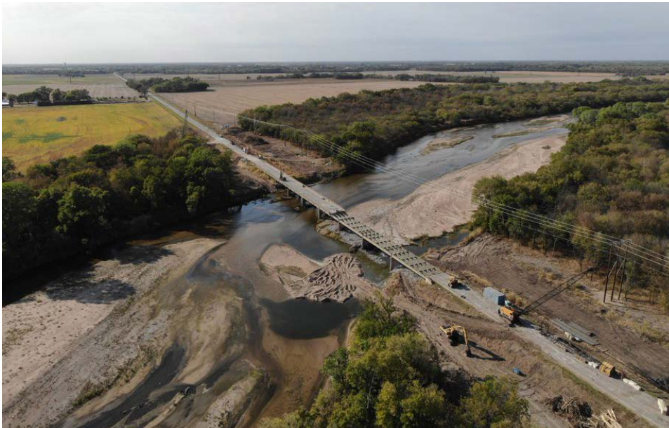
Early work on the K-55 bridge replacement at the Arkansas River between Belle Plaine and Udall, in Sumner County.