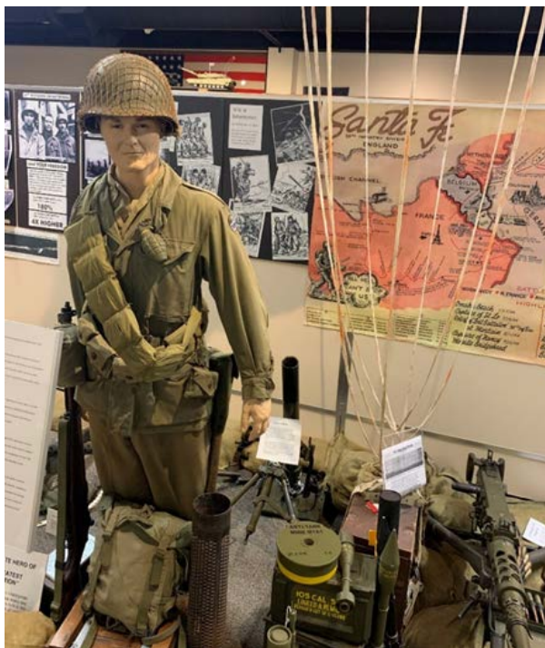
Artifacts on display at the 35th Infantry Division Museum.