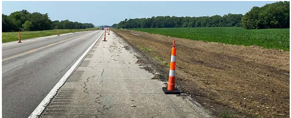
Grading is underway on the U.S. 169 passing lane project south of Thayer.

However, U.S. 169 improvements are not quite finished. In late March, work began to add passing lanes and extend the Elk Creek Bridge north of K-47. A second passing lane project started south of Thayer last month.