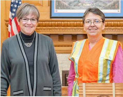
Above: Governor Kelly took an individual photo with Ocasio. (The Governor even wore Ocasio's vest for the group photo.)