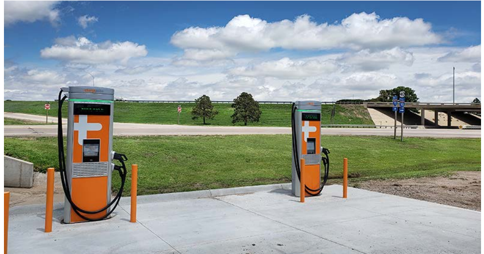
The Oakley EV charging stations opened for service on March 31. The stations are located just off of I-70 at Mitten's Travel Center.

Work is currently underway on stations at the Matfield