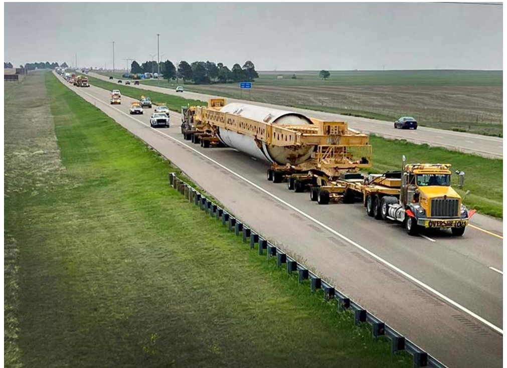
The two SpaceX loads travel along I-70 near WaKeeney. The loads entered Kansas in the Kansas City area by way of I-435 and exited on U.S. 56 in District Six.

According to Dominique Shannon, Bridge Evaluation and Management Engineer, KDOT routes approximately 6,000 superloads each year, with only 8 to 10 of them being this extreme in size.