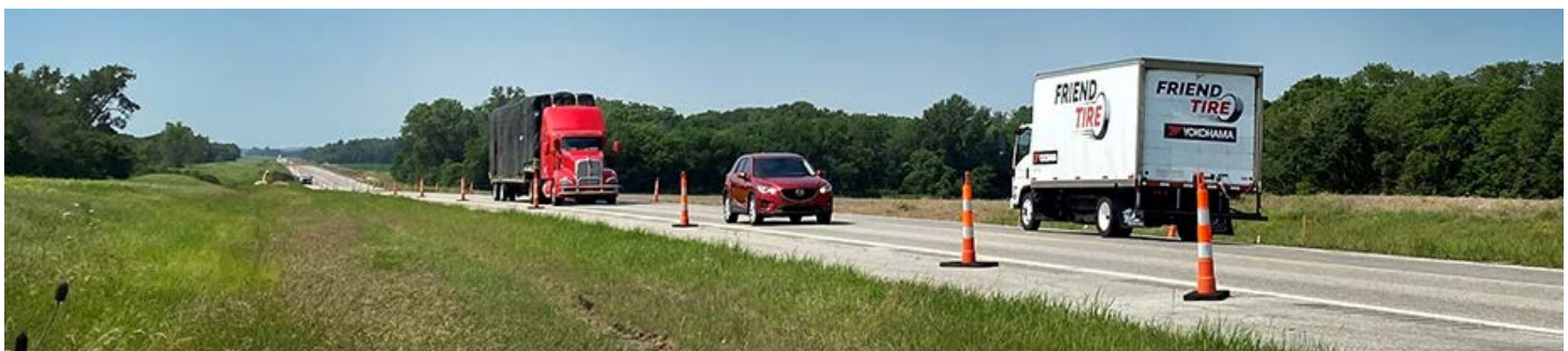
Truck traffic is common on U.S. 169 throughout the region.

Clarkson Construction Co. is the primary contractor on both projects, which are expected to be complete late this year. For now, the speed limit is reduced through both work zones. The 90-day closure is expected to go into effect later this summer.