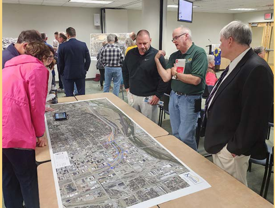
Display boards, a PowerPoint slideshow and project staff provided information to attendees at the I-70/Polk-Quincy Viaduct community open house.

The Polk-Quincy Project will replace the 58-year-old viaduct, widen I-70 and provide frontage road and pedestrian connections to downtown Topeka. More information can be found at www.polkquincy.org .