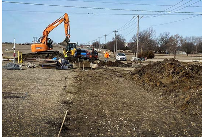
Work is underway at the intersection of Plummer Avenue and 21st Street in Chanute.