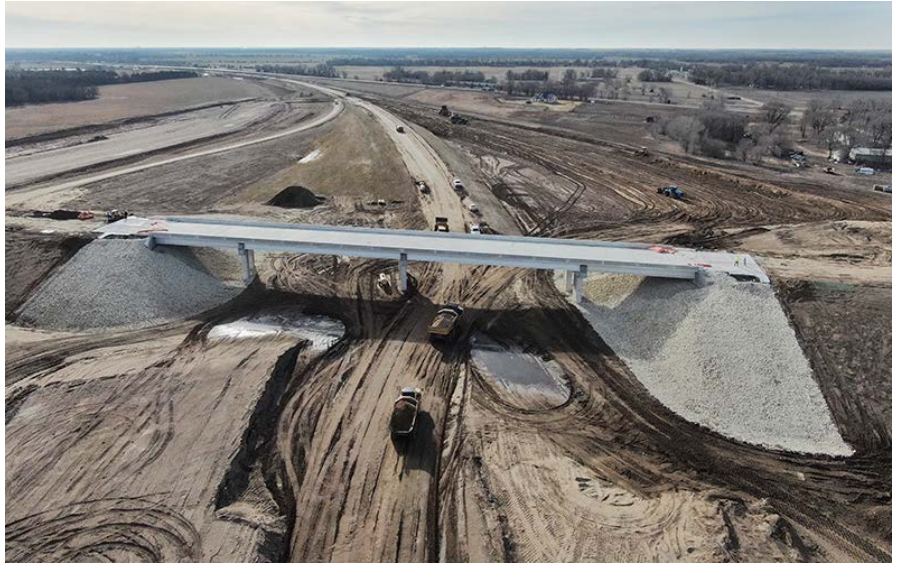
Aerial views of the K-14 project from January show ongoing work at the 56th Avenue interchange (above) and at the Broadway interchange (below) just north of Sterling.

Bob Bergkamp Construction Co. Inc., of Wichita, is the primary contractor.