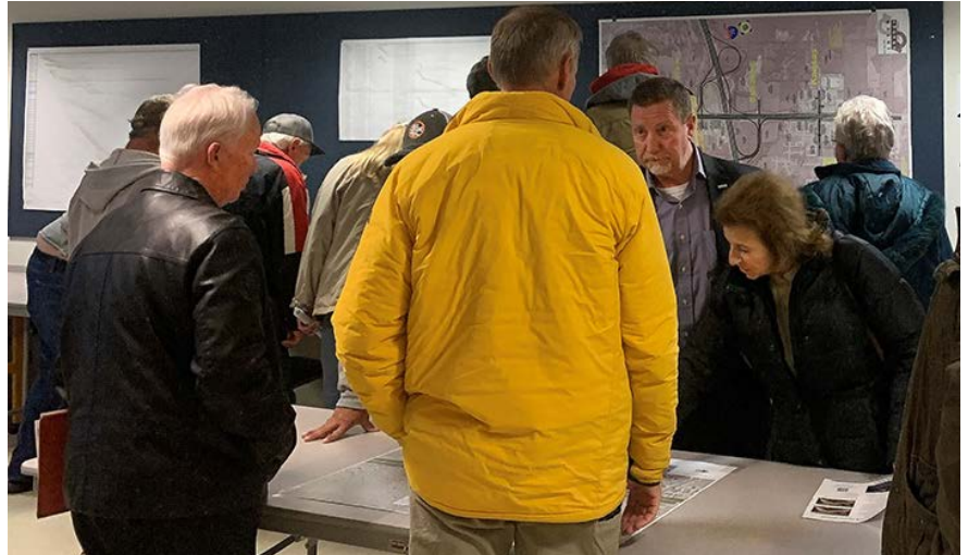
Visitors review project materials at a Feb. 23 public meeting held at the Bonner Springs shop.

Details on the K-96 improvements project were presented to the public on Feb. 2 in Wichita. The project