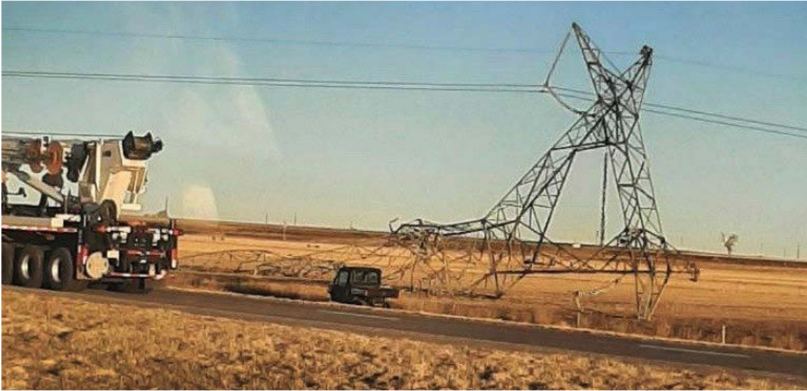
Hector Terrones, Highway Maintenance Supervisor in Garden City, took this photo of one of the damaged electrical towers along U.S. 50 west of Garden City. Several towers were blown over by a tornado or damaging winds in the area.

The National Weather Service in Dodge City issued severe thunderstorm and tornado warnings for several areas in western Kansas on the late afternoon on Feb. 26. The high winds blew over several electrical towers