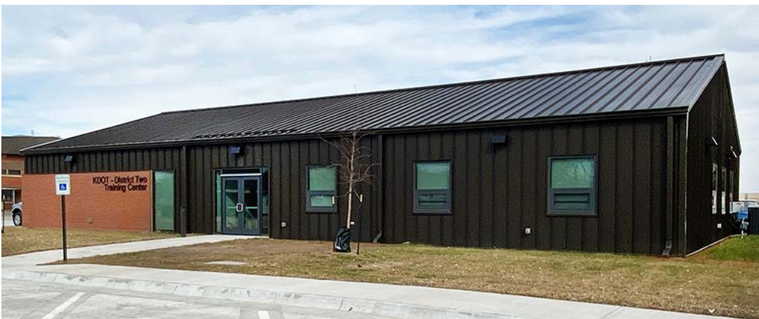
Top: Former annex building. Above: Demolition of the building. Left: New District Two Training Center in Salina.