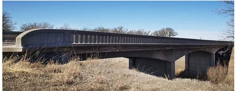
KDOT will replace the current continuous span structure, seen above and below, with a three-span, haunched slab bridge.