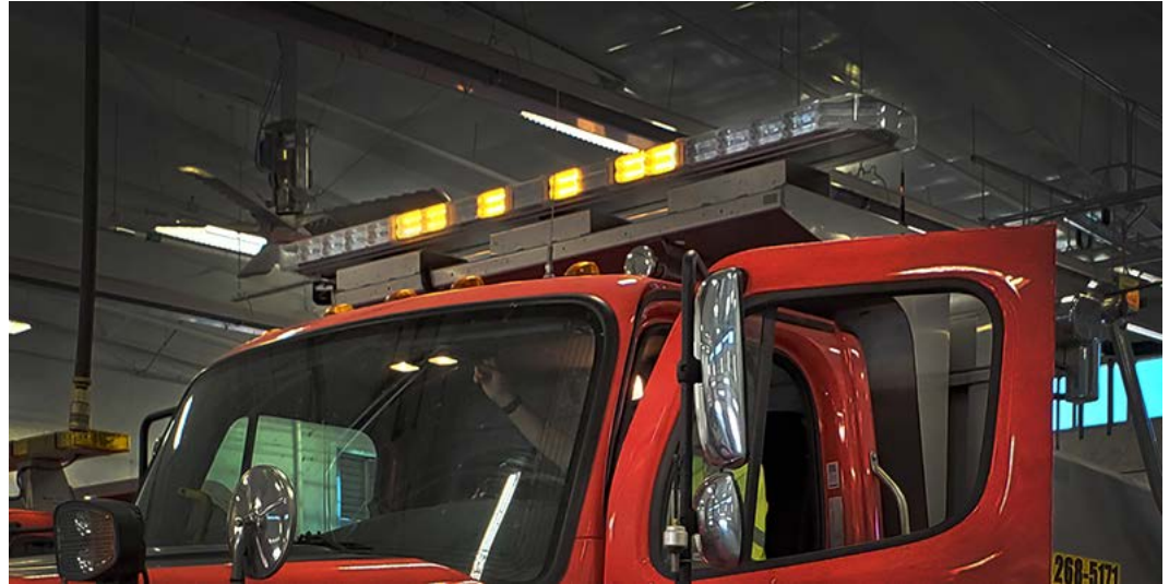
Warning lights on the truck (above) can be synchronized by operators with this box (below) to other warning lights in the area.

Operators must select the same mode, such as low