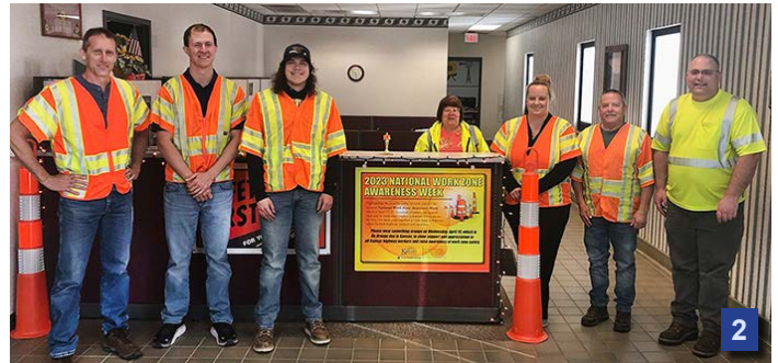
A few of the KDOT employees and locations participating in Go Orange include: 1. Concordia. 2. Hays. 3. Liberal. 4. Gardner. 5. Governor's Mansion in Topeka. 6. Wichita. 7. Fort Scott. 8. Wichita bridge.