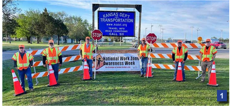
A few of the KDOT employees and locations participating in Go Orange include: 1. Yates Center. 2. Oakley Area office. 3. Fiscal and Asset Management. 4. Blaine.

He asked that travelers think of the workers they are passing: "These guys out there are a foot away from traffic. There's a cone between you and a semi going 70."