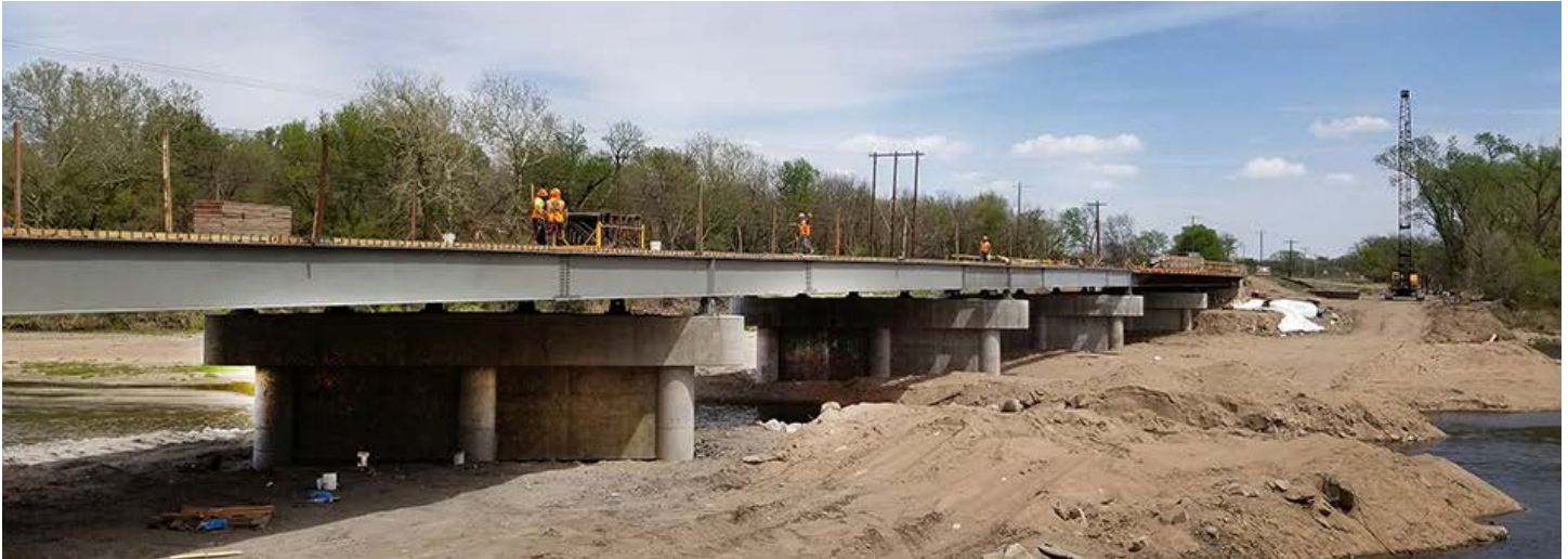
Contractors have been working on the deck of the new K-55 bridge between Belle Plaine and Udall, in Sumner County.