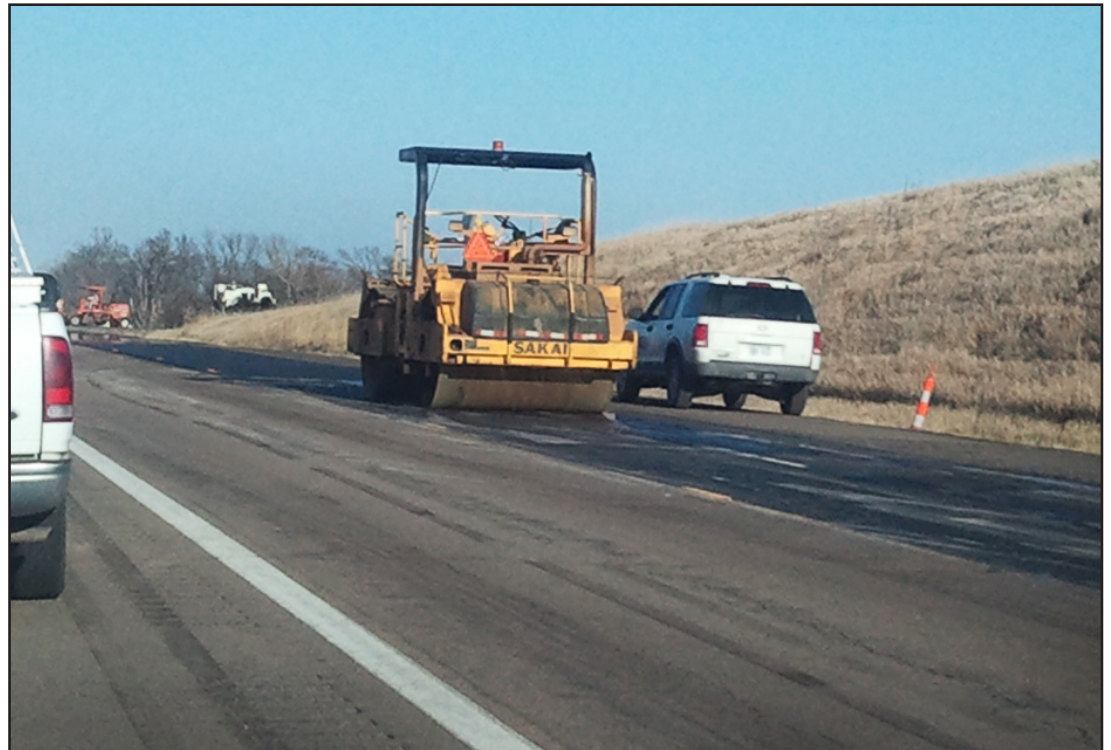
A new seal is placed on U.S. 36 in Republic County.

Road work is underway on U.S. 36 and K-139 in Republic County and on K-22 in Washington County as a chip seal is applied to the highways. On U.S. 36, the project starts at the east city limit of Belleville then east to the Republic/Washington county line. The K-22 project begins at the U.S. 36/K-22 junction then north to the south city limit of Haddam. K-139 beginning at the U.S. 36 junction south to the city of Cuba is included in this project. The chip seals are expected to be completed in early August.