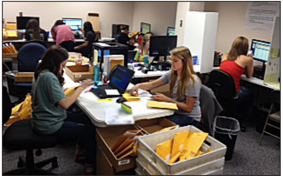
K-TAG 'Swap' center specialists are busy filling orders from K-TAG customers.

K-TAG 'swap' started: Late May marked the start of a four-month K-TAG replacement project. The KTA is asking select customers to 'swap' their battery operated hard case K-TAGs for tags with newer, more efficient technology. The replacement tags will be provided at no cost. Not all customers with hard case K-TAGs are affected. Only those contacted by KTA need to take action. Customers affected – nearly 60,000 - are being notified via emails and letters May through July. Tags not swapped out will be deactivated or turned off starting in mid-August through September. The old tags can be recycled or discarded by the customer and do not need to be returned to KTA.