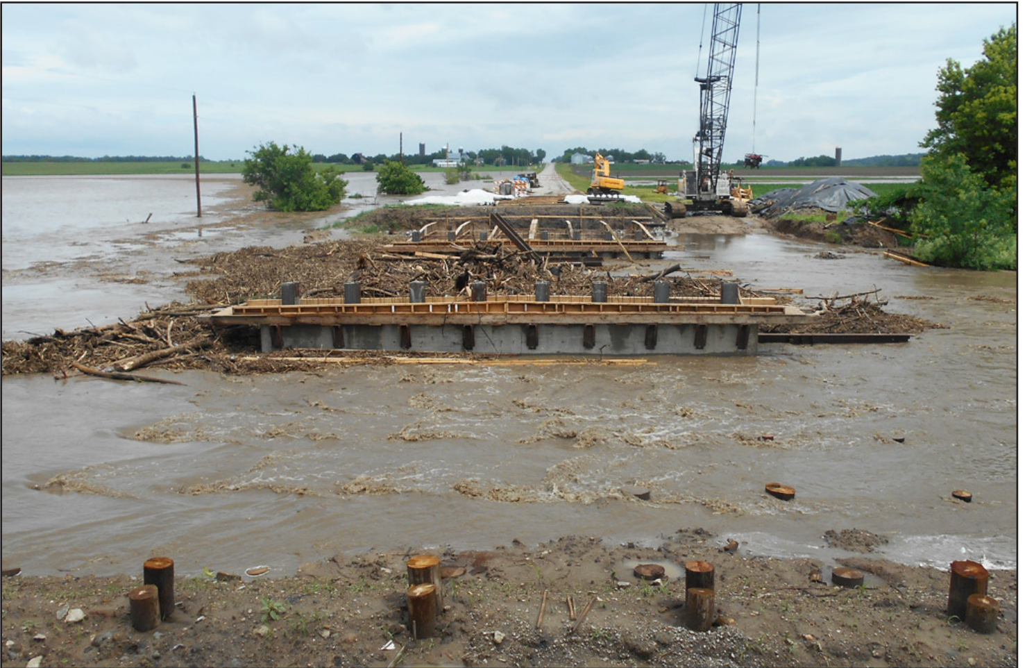
The photos above and below show the flash flooding damage that occurred in the past week in Nemaha County on the K-63 bridge work that was taking place as part of the bridge replacement project.