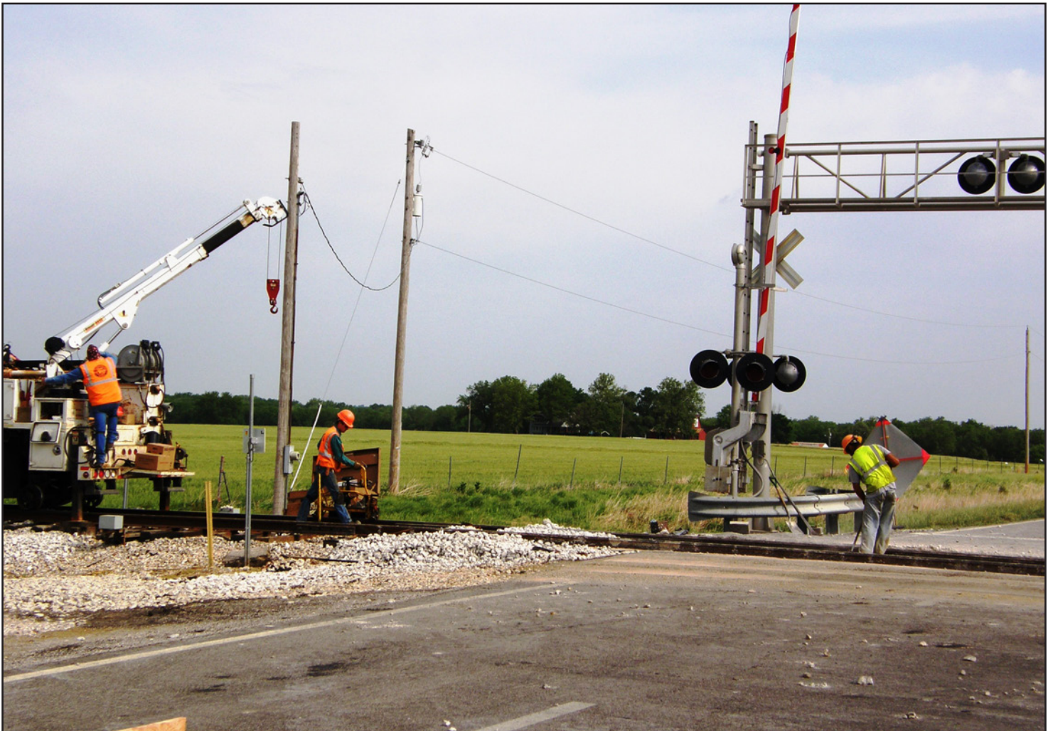
Crews with the South Kansas & Oklahoma (SKOL) Railroad replace tracks at the crossing on U.S. 169 southwest of Cherryvale. KDOT closed the highway at the crossing May 19-22 for the project.